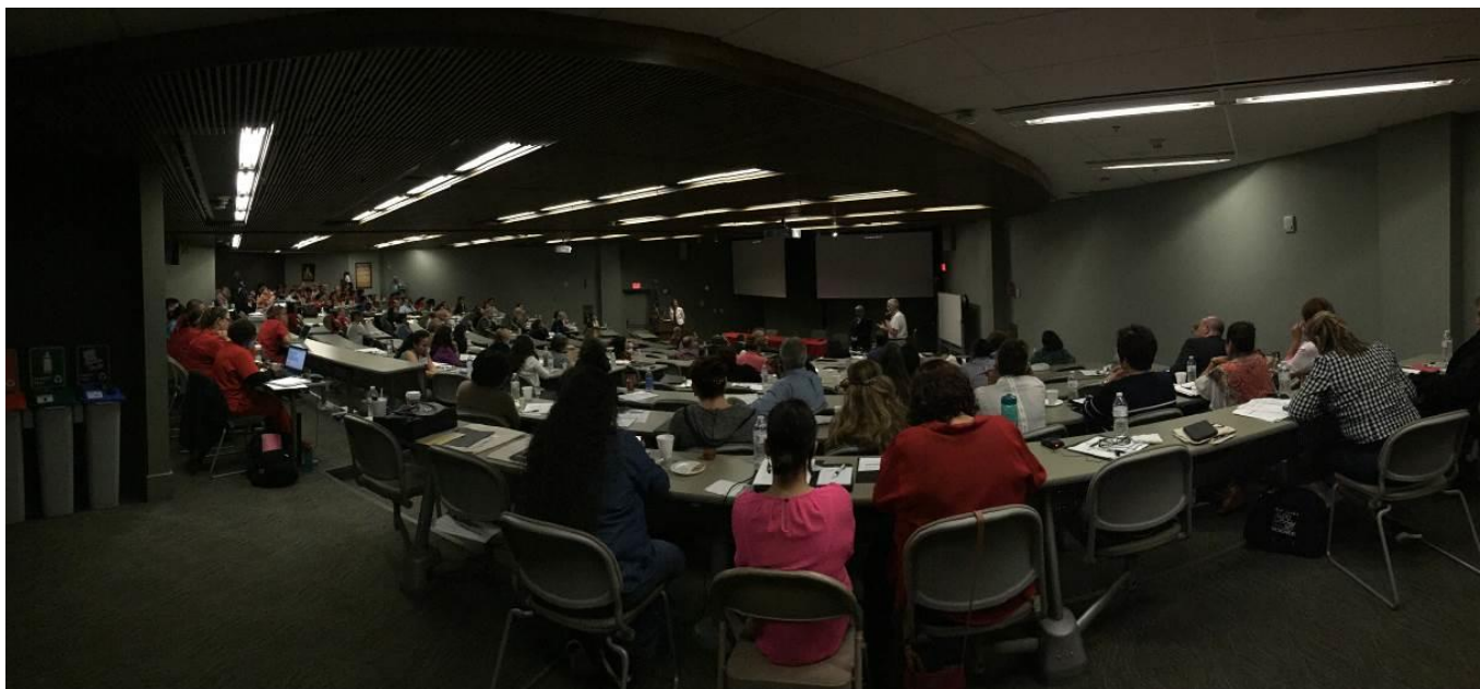
Children's Health Symposium Attendees

Thirty experts presented on asthma, lead and mercury exposure, climate change impacts on children's health and a dozen other topics. Simultaneous English-Spanish translation was provided for all the presentations. Discussion topics included: climate change impacts on children's health, and prenatal exposures; childhood breathing--healthy lungs and good indoor air quality; e-cigarettes; unconventional petroleum exploration concerns; carbon monoxide; asthma, and lead. Final symposium agenda, presentations, and speaker bios are available for download at the symposium website.