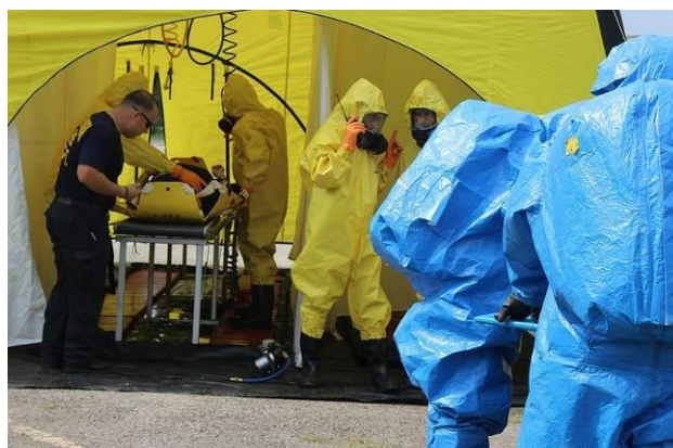
Practice medical evaluation of hurt personnel during exercise