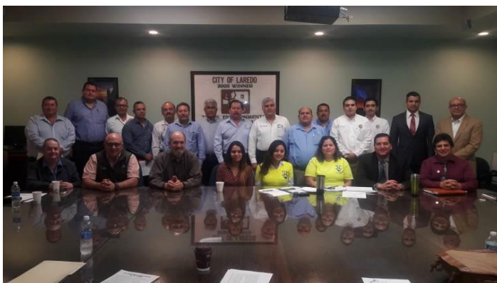
Meeting Participants in Falcon Task Force on March 8, 2016.

The Falcon Task Force.- WASTE Committee met on March 8, 2016, hosted by City of Laredo Environmental Services, with 25 people attending, including managers from local environment and solid waste departments, as well as Representatives of the Laredo City Council and the Mayors of Laredo and Nuevo Laredo, who joined State government official representatives of TCEQ and the Nuevo Leon Secretariat of Environment and Sustainable Development., BECC, Mexico's Consulate General, local educational institutions, USEPA and SEMARNAT.