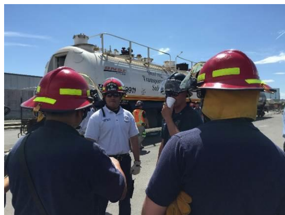
July 2015 Training Event First Responders

The project funded helped to increase preparedness for possible hazardous railcar incidences, increase mitigation capabilities and helped to re-establish and continue communications between first responders between the communities of El Paso, Ciudad Juárez and Doña Ana County. The project entailed the purchase of the three Midland Kits, equipment used to stop and contain leaks that may occur if a railcar incident were to occur involving hazardous substances. Each of the jurisdictions received one of these kits. The kits are the most state of the art pieces of equipment that first responders can use for such incidences. None of the three jurisdictions had this piece of equipment prior to the grant. The equipment was necessary as the rail industry