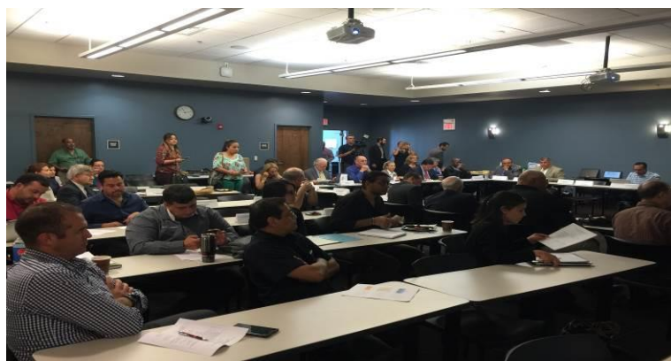
Over 50 Bi-national stakeholders attended the May 2016 Meeting.