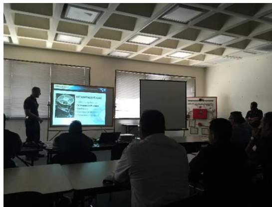
April 2016 Refresher Training

In July 2015, more than 120 first responders from El Paso, Ciudad Juárez and Doña Ana County Fire Department, over a three day period, received the proper training needed to operate and learn how to use the Midland Kits. Trainers from BNSF who invented the Midland Kit trained the responders, utilizing a mock railcar that was transported from their training rail yard. The training consisted of lecture, PowerPoint and dialogue between the training participants and instructors. The final portion of the training involved utilizing a Midland Kit on a training rail car, to properly learn how to handle this piece of equipment. The training event was covered by the local media, generating six new stories on the local television in both El Paso and Juárez, as well as, two newspaper articles, one in the El Paso Times and another in the El Diario de Juárez.