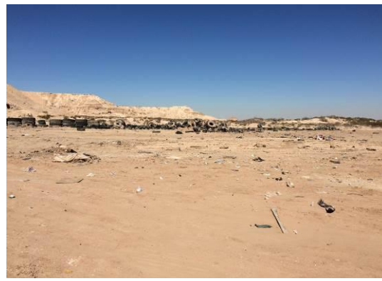
Illegal Scrap Tire Pile in Ciudad Juárez