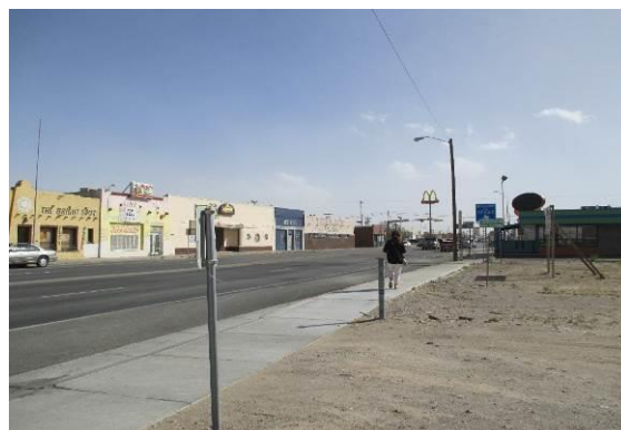
View of Main street in Anthony, New Mexico

The second day consisted of the actual workshop focused on identifying and revitalizing the down's main street, strengthening the local economy, providing housing options and efficient infrastructure. The final product was a Next Steps Memorandum for the Sustainable Strategies for Small Cities and Rural Areas will serve as an action plan for the City of Anthony to use as a guide for moving forward in their city growth. Attendees included representatives from Housing and Urban Development (HUD), Senator Udall's office, Senator Heinrich's office, NGO's, and EPA R6 staff members Arturo Blanco, Carlos Rincon, Maria Sisneros and Debra Tellez.