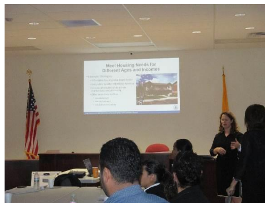
February 23-24, 2016 Attendees Workshop

EPA developed the Making a Difference (MVD) Initiative to “work each and every day - hand-in-hand with other federal agencies, states, tribes and local communities - to improve the health of American families and protect the environment one community at a time, all across the country to better support the efforts of communities, especially those that are environmentally overburdened, underserved, and economically distressed.” The City of Anthony, formed in 2010, is in the early stages of community development planning. The city does not own any of its utilities, and lacks adequate zoning and subdivision regulations as well as recreational facilities. The city hopes to have green components installed to detain flows and remove sediment to deal with flooding issues. EPA will work with the community to assist with the development of sustainable municipal services and infrastructure by fostering partnerships and leveraging resources from other federal, state and local agencies.