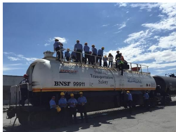
July 2015 Responders from Ciudad Juárez, Doña Ana and El Paso