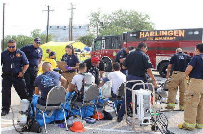
Medical monitoring of responders during May 2015 exercise

The table top and functional exercises looked at a response that involved a release of a ton from a chlorine cylinder as well as a release of chlorine from a rail car. The project funded resulted in the enhancement of a bi-national response by including the latest technology advancements for communications; enhanced the response capabilities of responding to a potential chemical exposure/accident that could affect both sides of the border; and updated the sister city plan contacts. The final day which included the functional exercise was covered by local media. The story can be found at: http://www.rgvproud.com/news/local-news/fire-departments-team-up-for-hazmat-training