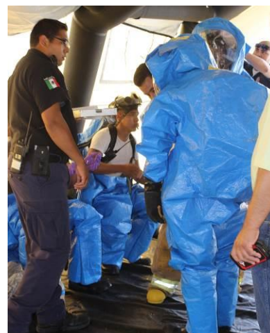
May 2016 Training Event First Responders between Harlingen and Matamoros.

The City of Harlingen received a $60,000 Border 2020 Grant of for cross-training and exercises with the City of Matamoros. The objectives of the project included: training for the tactical incident management of on-scene operations at a Hazardous Materials Incident; preparation of the First responders to manage during the first hour of a Hazardous Materials Incident; learn how to identify hazardous Materials transporting containers; learn control techniques for leaks and spills and; train to use the Incident Command System (ICS) and remote communication technology. Part of the training included review the sister-city contingency plan in place and utilizing it while conducting a table top and functional exercise.