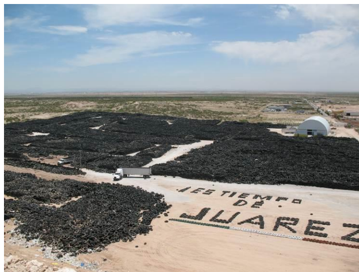
Ciudad Juárez Tire Pile prior to Border 2020 Program

A successful example of a binational cooperation is the Paso del Norte Tire Advisory Committee (TAC), spearheaded in 2014 by the Texas Commission on Environmental Quality (TCEQ), EPA Region 6 in Dallas, and the State of Texas Alliance for Recycling (STAR), with support from the Rubber Manufacturers Association (RMA).