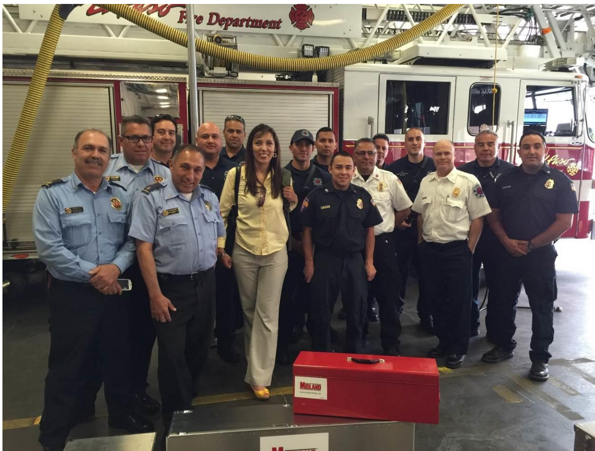
Equipment Exchange to Ciudad Juárez and Dona Ana County First Responders.