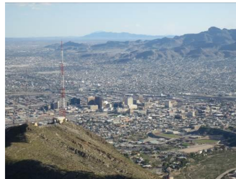
View of City of El Paso Texas.

In October 2015, the El Paso Border Office was restructured and joined with the Office of Environmental Justice and Tribal Affairs to become the Office of Environmental Justice, Tribal and International Affairs (OEJTIA). The OEJTIA works closely with communities to facilitate culturally sensitive communication, find solutions, or reduce environmental challenges.