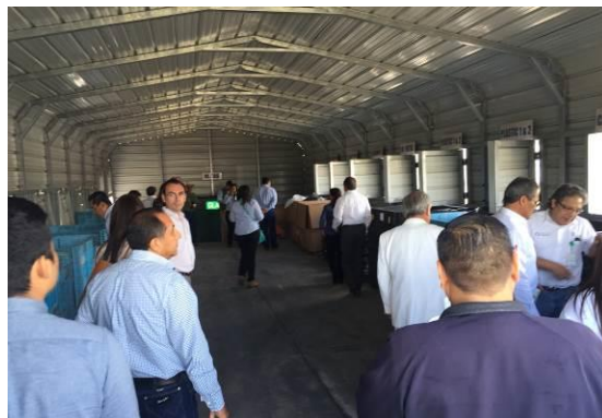
Gulf TF participants tour Pharr Recycling Center

The City of Pharr, a previous recipient of Border 2020 funds, presented their recycling program “Let’s Clean it and Green it Up” as well as gave stakeholders a tour of their recycling facility. The City of Pharr received a Border 2020 grant to offer more frequent and convenient solid waste disposal events, as well as host more beautification and cleanup events and improve their recycling and outreach programs.