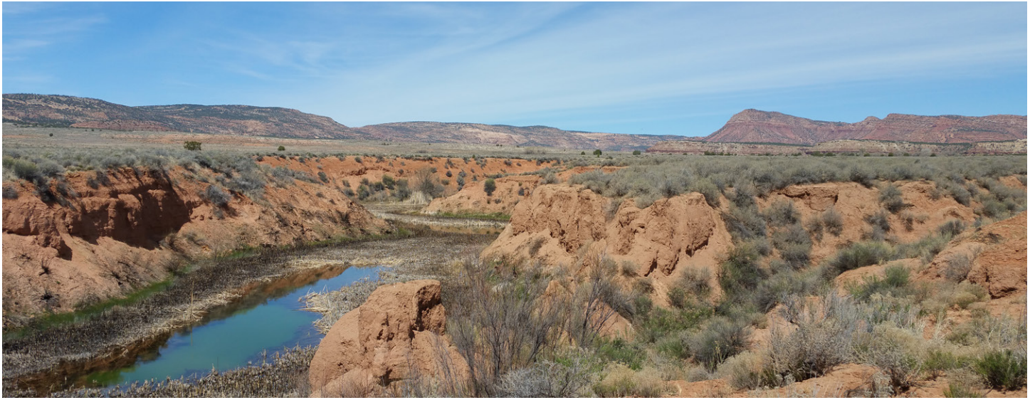
Kaibab Band of Paiutes