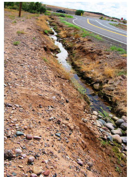
The Salt River Pima-Maricopa Indian Community is using 319 funds to reduce NPS pollution on their reservation.

For more information, please refer to EPA Region 9’s FAE Handbook for Indian Tribes at www.epa.gov/tribal/clean-water-act-water-quality-planning-and-protection-programs-financial-assistance