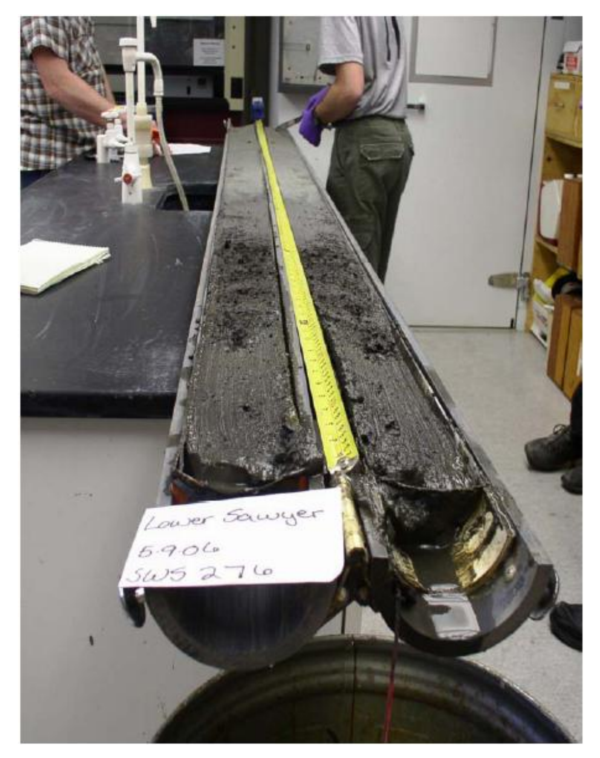
Figure 2. A properly split core, producing two nearly identical halves. The central, nearly undisturbed portions of either core half can be used for sample extraction. After splitting, photographs of one of the core halves can be taken, using an appropriate photo scale, and uniform lighting.