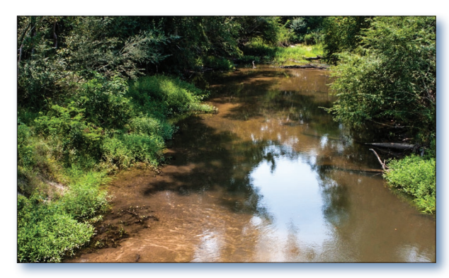
Figure 3. Data were collected at this Big Creek monitoring site.

Since 2008, USDA's Natural Resources Conservation Service (NRCS) has assisted local landowners in implementing dairy and cattle farm BMPs. In 2012 the Louisiana Department of Agriculture and Forestry (LDAF) partnered with NRCS to continue implementing these BMPs, which included nutrient management (3,659 acres), fencing (463 acres), field borders (89 acres), forage harvest management (617 acres), heavy use area protection (366 acres), irrigation pipeline (144 acres), livestock pipeline (67 acres), livestock shade structure (77 acres), pond (43 acres), prescribed grazing (3,606 acres), residue and tillage management (363 acres), sprinkler system (114 acres), upland wildlife habitat management (150 acres), waste facility closure (77 acres), waste recycling (598 acres), water well (35 acres) and water facility (256 acres). Road signs stating, "Big Creek Watershed: Ours to Protect," were also placed along roadways throughout the watershed in an effort to raise public awareness.