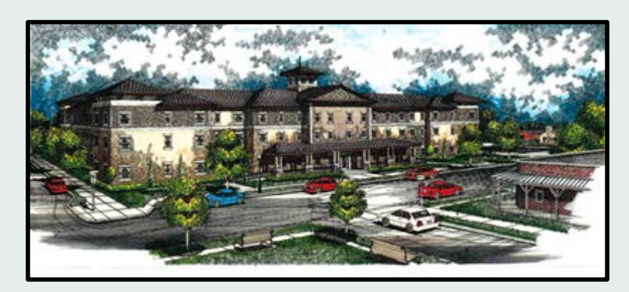
Wheatley Park Senior Living