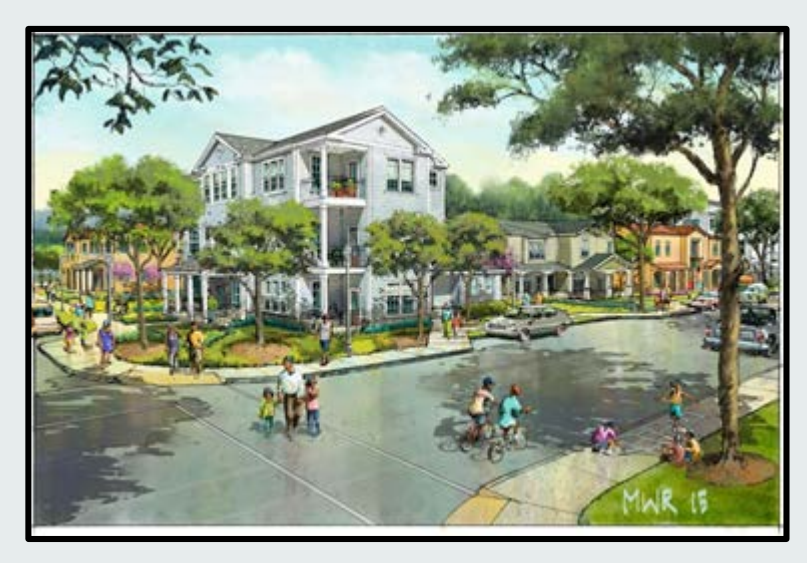
East Meadows I