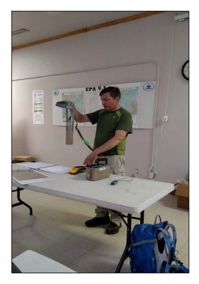
Weston Solutions gave an equipment demonstration to participants.

During the meeting, EPA and Weston Solutions staff discussed safety concerns and hazards associated with working outdoors. Potential hazards include heat stress, flash floods, trip hazards, lightning and wildlife. Weston Solutions staff provided an equipment demonstration and explained how each piece of equipment is used in