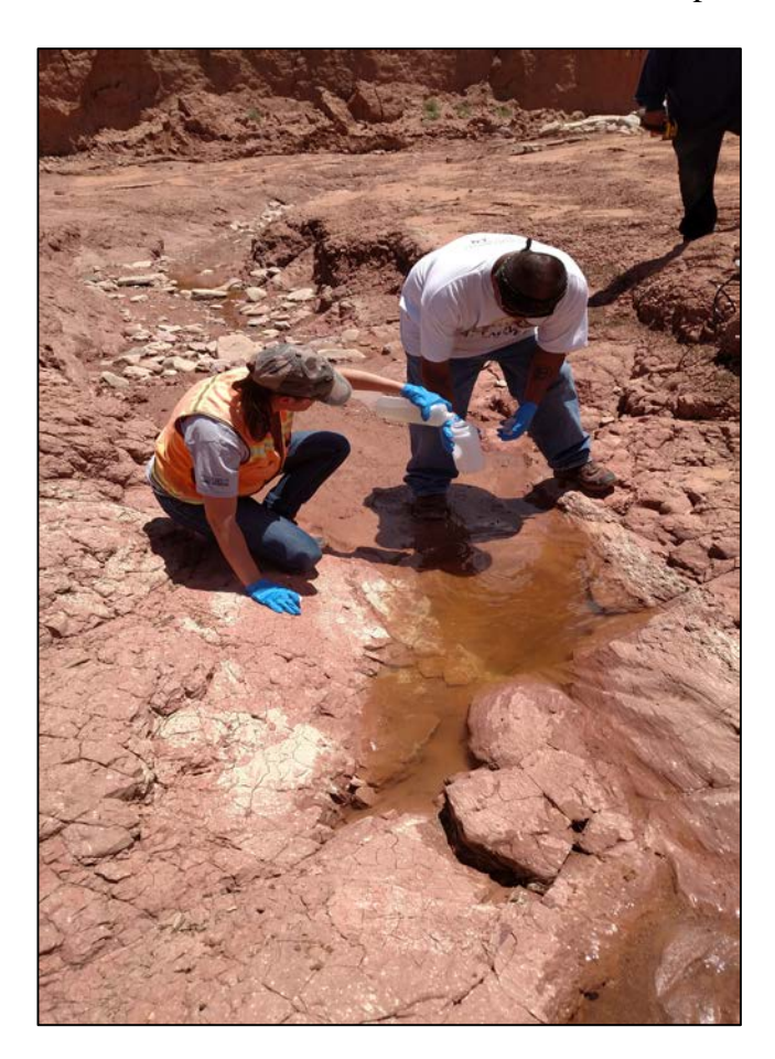
Participants taking part in collecting surface water and sediment samples in Cove Wash.

At the end of the meeting, the sampling team broke into two teams. The teams included representatives from Weston Solutions and interns from the Dine Environmental Institute, the New Mexico Institute of Mining and Technology, NM EPSCoR, Navajo Technical University, and Eastern New Mexico University. The teams traveled to Zone 3 – located in Cove Wash, about one mile north of Indian Route 33 – to collect surface water and sediment samples.