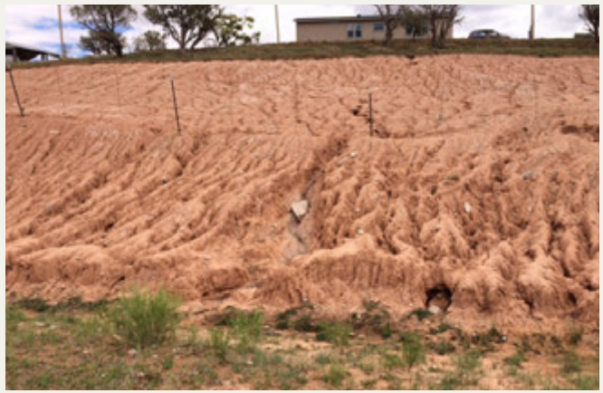
Small channels and gullies along the side of the slope.

Approximately nine to 12 months after site restoration, the site will be inspected to observe and recommend where any maintenance may be required.