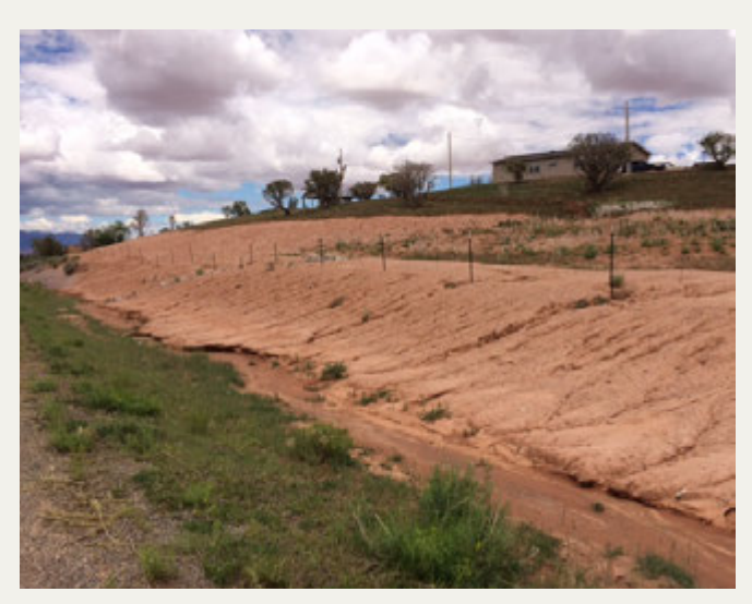
Eroded soil at the base of the slope.

The former Cove Transfer Station #1 is located on non-addressed property in Cove Chapter, Apache County, Arizona (within the Navajo Nation), off of Bureau of Indian Affairs (BIA) Route 33, approximately 40 miles southwest of the community of Shiprock, New Mexico.