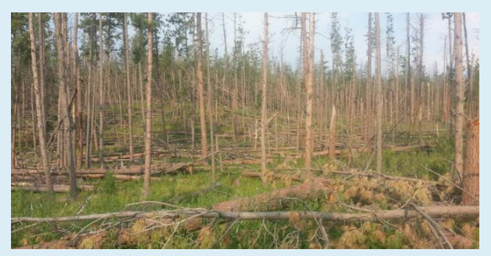
Trees killed by a mountain pine beetle infestation in the Black Hills.

Longer growing seasons and increased carbon dioxide concentrations could increase the productivity of forests. Although forests generally benefit from higher productivity, warmer