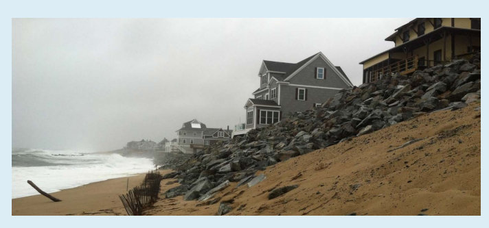
Sea level rise, stronger storms, and coastal erosion threaten parts of the New England coastline such as these homes in Newburyport.

Coastal cities and towns will become more vulnerable to storms in the coming century as sea level rises, shorelines erode, and storm surges become higher. Storms can destroy coastal homes, wash out highways and rail lines, and damage essential communication, energy, and wastewater management infrastructure. In the city of Boston alone, the total cost of storm damages during the 21st century could be between $5 and $100 billion, depending on how the city responds to rising sea level.