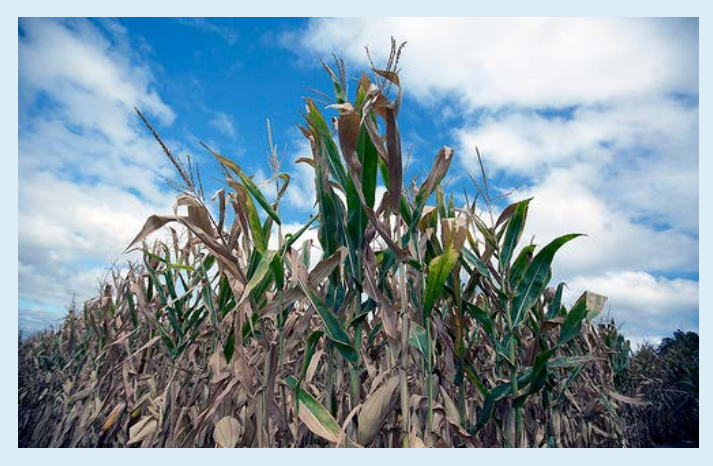
Drought-stricken com in Missouri Valley in August 2012.

Changing the climate will have favorable and harmful effects on farming, although the net effect is unknown. Longer frost-free growing seasons and higher concentrations of atmospheric carbon dioxide would increase yields for many crops during an average year. But increasingly hot summers are likely to reduce yields of corn and possibly soybeans. Higher temperatures are also likely to reduce livestock productivity, because heat stress disrupts the animals' metabolism. Seventy years from now, lowa is likely to have 10 to 20 more days per year with temperatures above 95°F than it has today. More severe droughts or floods would also hurt crop yields.