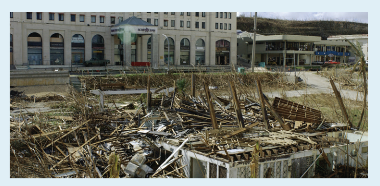
Damage caused by Typhoon Pongsona in 2002.

As the climate changes, typhoons may cause more damage. Guam lies in one of the world's most active regions for tropical storms. In 2002, Typhoon Pongsona caused $700 million in damages, destroyed 1,300 homes, and left the island without power. In just the last few years, neighboring islands have suffered from some of the strongest and most damaging tropical cyclones ever recorded, including Super Typhoons Haiyan (2013), Maysak (2015), and Soudelor (2015). Although warming oceans provide typhoons with more potential energy, scientists are not yet sure whether typhoons have become stronger or more frequent. Nevertheless, wind speeds and rainfall rates during typhoons are likely to increase as the climate continues to warm. Higher wind speeds and the resulting damages can make insurance for wind damage more expensive or difficult to obtain.