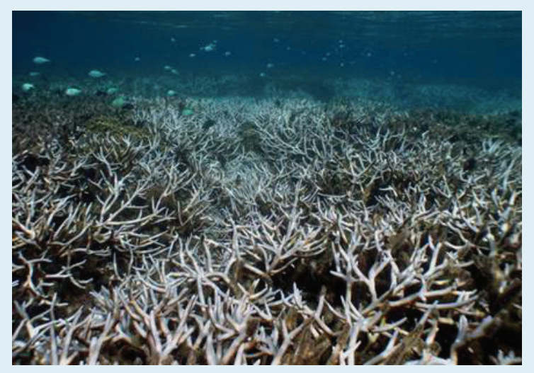
Bleached corals in the Tumon Bay Marine Preserve in 2007.

Warming and acidification could result in widespread damage to marine ecosystems. Guam is home to a diverse array of fish species. Sharks, rays, grouper, snapper, and hundreds of other fish species rely on healthy coral reefs for habitat. Reefs also protect nearshore fish nurseries and feeding grounds. A significant fraction of reef-dwelling fish are likely to lose their habitats by 2100. Increasing acidity would also reduce populations of shellfish and other organisms that depend on minerals in the water to build their skeletons and shells.