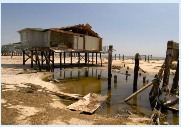
Hurricane Katrina's storm surge destroyed homes and roads on Dauphin Island in 2005.

Whether or not storms become more intense, coastal homes and infrastructure will flood more often as sea level rises, because storm surges will become higher as well. Rising sea level is likely to increase flood insurance rates, while more frequent storms could increase the deductible for wind damage in homeowner insurance policies. Many cities, roads, railways, ports, airports, and oil and gas facilities along the Gulf Coast are vulnerable to the combined impacts of storms and sea level rise. People may move from vulnerable coastal communities and stress the infrastructure of the communities that receive them.