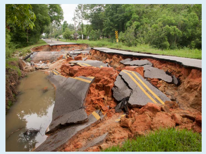
Flooding of a small stream in June 2014 destroyed this roadbed in Foley.

Droughts create a different set of challenges. When reservoirs release water for navigation along the Tennessee or Black Warrior rivers, too little water may be available for lake recreation or hydropower. Low flows from drought occasionally limit navigation along the Alabama River. During severe droughts in the Mississippi River's watershed, however, navigation can potentially increase on the Tennessee-Tombigbee Waterway, which provides an alternative route to the Gulf of Mexico.