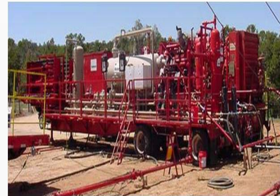
Example of Green Completion Equipment