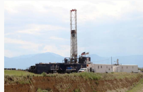
A natural gas well site.