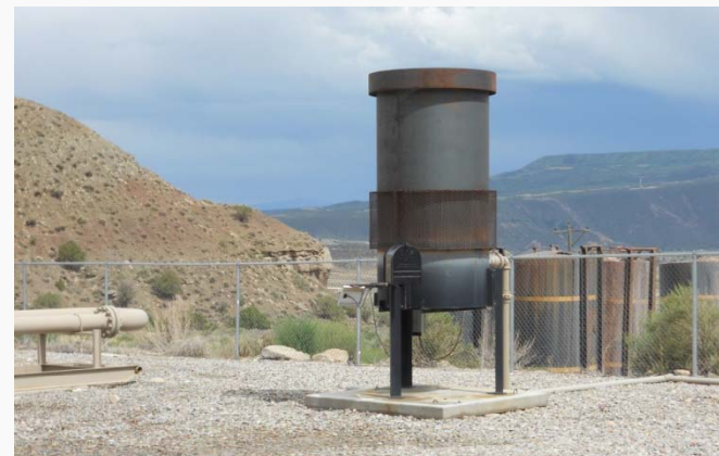
A combustion device and storage tanks.