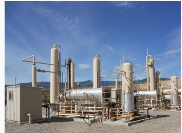
Glycol dehydrators at a well production pad.