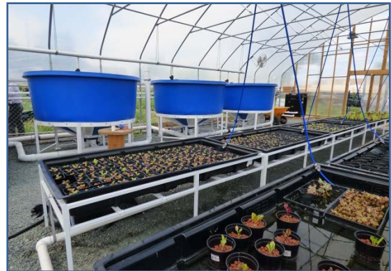
Figure 5: Aquaponic operations in the District of Columbia