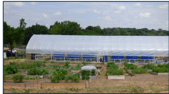
Figure 1: Aquaponic operations in the District of Columbia

This User Guide emerged from a dynamic project partnership between EPA Region 3, Delaware State University, Kent Economic Partnership, Kent Community Gardens Collaborative and Delaware Division of Public Health.