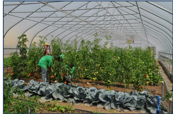
Figure 6: Urban Farm Employee