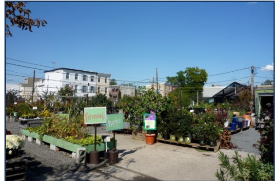
Figure 2: Example Urban Farm Data source: Image via Flickr, courtesy of David Barrie