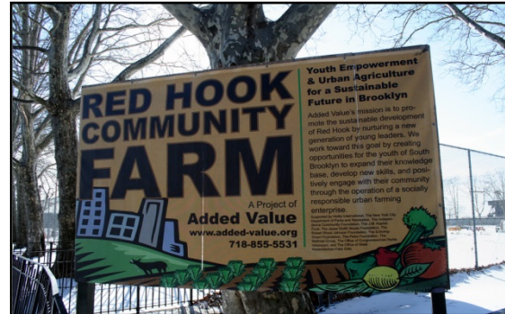
Figure 3: Example Urban Farm Marketing Data source: Image via Flickr, courtesy of David Boyle

Defining a strategy for marketing and sales is the most important part of your business plan. If a market does not exist or if a workable approach for getting your product to the market has not been identified, you will not meet your goals or expectations. The development of your marketing strategy will require an understanding of the market, including the demand for your product, the potential customers, and the potential competitors. In developing a marketing strategy, you need to convince yourself, as well as the reader of the business plan, that there is a viable market for your product. The marketing strategy is divided into seven sections: