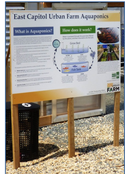
Figure 4: marketing for Aquaponic Farm in the District of Columbia

Use Worksheet # 12 (Sales Volume) to document information about potential sales volumes. Complete a worksheet for each market segment.