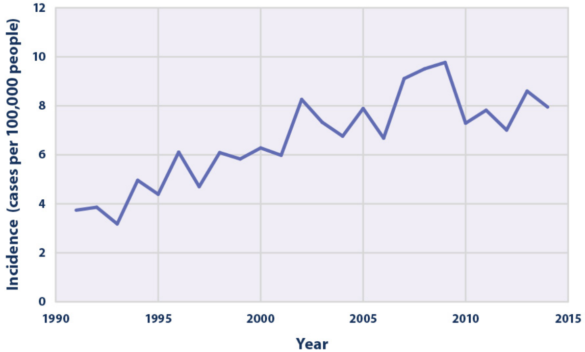
Figure 1. Reported Cases of Lyme Disease in the United States, 1991–2014

This figure shows the annual incidence of Lyme disease, which is calculated as the number of new cases per 100,000 people. The graph is based on cases that local and state health departments report to CDC's national disease tracking system.