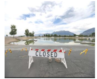
Utah Lake State Park , July 15 th , 2016