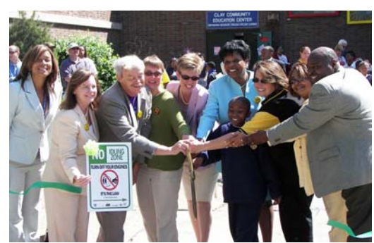
Partners join together for a ribbon-cutting ceremony at Clay Elementary School, opening the first "No Idling Zone" at a public school in St. Louis.

Please visit the CARE Web site at <a href="https://www.epa.gov/CARE">www.epa.gov/CARE</a> for more information.