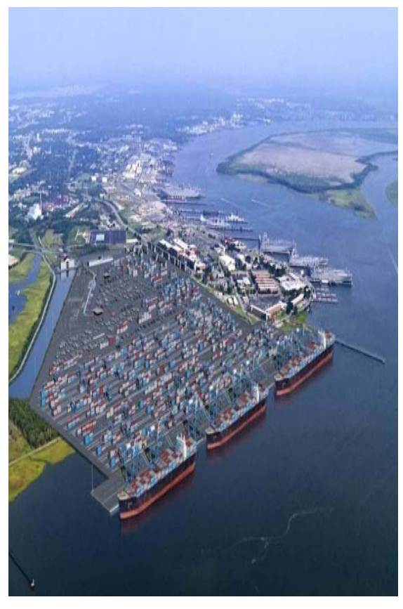
New North Charleston Port, SC

This report discusses opportunities to build resilience among environmental justice communities in industrial waterfronts, particularly in light of the challenges posed by climate change. Hurricane Katrina's devastation of the gulf coast states (Louisiana, Mississippi, Alabama, Florida) and Superstorm Sandy's impact on the greater New York City region (New York, New Jersey, Delaware, Connecticut) provided a wakeup call to the nation about the changes forthcoming in climate. and the need to be better prepared to meet the challenges ahead. The intensity and regional impact of these storms showed that existing emergency response models alone no longer provide a viable framework for prevention and relief. The old models focused more on vulnerability and after-thefact intervention. A changing environment calls for a more useful strategy that focuses on planning for resilience to prevent, adapt, and recover from events and most importantly to save lives. This report asks what communities, local businesses, and government can do to prevent or minimize socio-economic dislocation and dysfunction before another natural hazardous event takes place. The report can also be used by local, state and other federal entities to assist in other types of communities across the country, and located near water bodies.