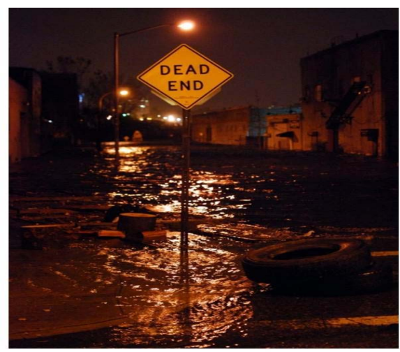
Superstorm Sandy Flooding. Red Hook. Brooklyn, NY

Industrial waterfront communities consist of people living and working near or adjacent to industrial facilities and sites, clustered on waterfronts, whether urban or rural. Examples include heavy manufacturing and industrial operators (such as infrastructure utilities) that require the handling, storage, transfer, and disposal of hazardous substances. Heavy industrial and manufacturing uses and polluting infrastructure are among the environmental hazards for urban industrial waterfront communities, where there is potential for contamination by unsecured heavy chemicals. Examples of these uses include oil refineries, chemical and petroleum bulk storage, power plants, and solid waste management facilities. Industrial Confined Animal Feeding Operations (CAFOs) are among the environmental hazards for rural and agricultural industrial waterfront communities where there is a potential for contamination by animal waste in unsecured waste lagoons. In addition, differences in topography and types of weather events gives each industrial waterfront community unique concerns.