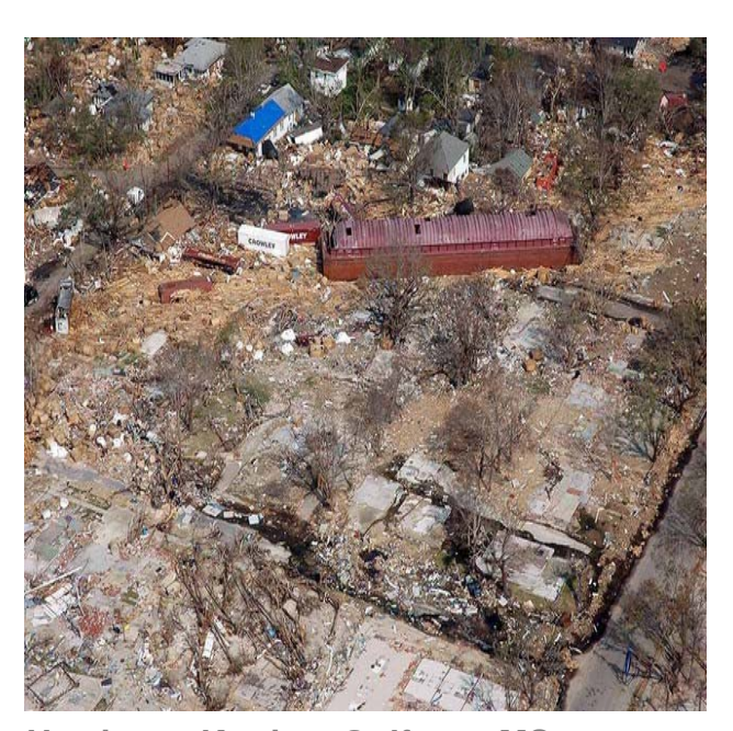
Hurricane Katrina. Gulfport, MS

Storm surge threatens petroleum and chemical storage facilities. During Hurricane Katrina, one million gallons of oil stored at the Murphy Oil Refinery in Mereaux, Louisiana flowed into canals and inundated