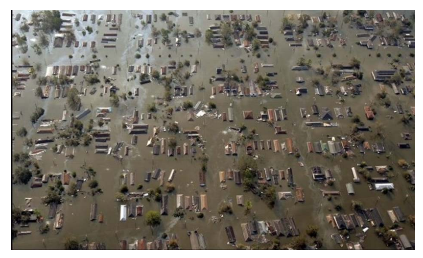
Hurricane Katrina New Orleans, LA