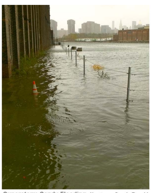
Superstorm Sandy Flooding. Newtown Creek. Brooklyn, NY

thousands of homes after storm surge moved the tank off its base. 1112 This is also the case in New York City following Superstorm Sandy, where 18 facilities regulated by the local Community Right-To-Know (CRTK) program reported spills. One of these facilities was a power plant, a type of facility associated