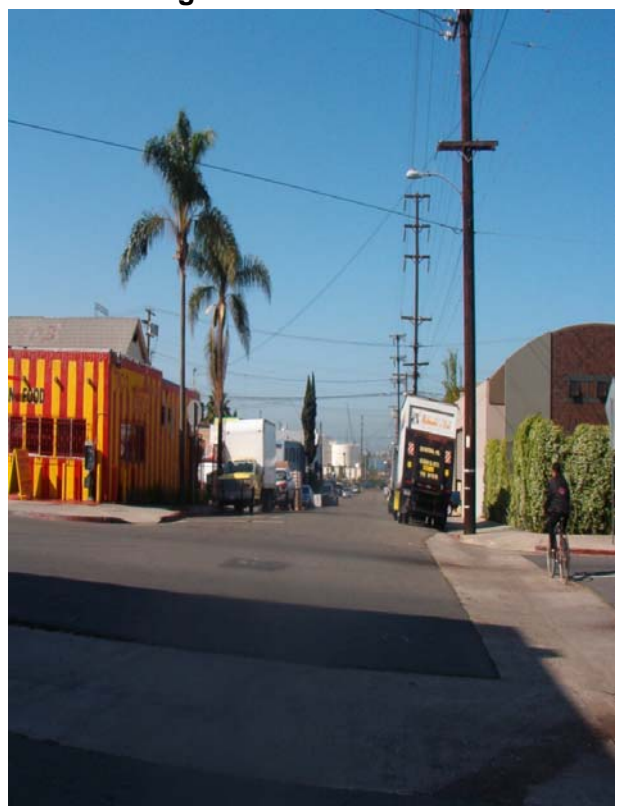
Barrio Logan and the San Diego

Title: Community Resiliency in San Diego