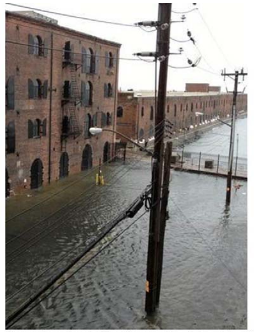
Superstorm Sandy Flooding. Red Hook. Brooklyn, NY

Title: New York City Significant Maritime and Industrial Areas (SMIAs) and the New York City Environmental Justice Alliance's (NYC-EJA) Waterfront Justice Project