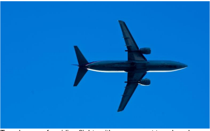
Travelers pay for airline flights with government travel cards.

Unless specific statutory authority exists to allow refunds to be used for other purposes, refunds must be returned to the appropriation or to the account from which the funds were expended. The appropriation or account can use refunds for any legitimate purchase for which the funds were returned, or as authorized by statute.