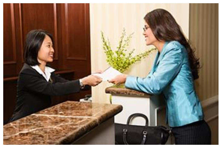
Lodging expenses should be placed on the government charge card.

On February 16, 2012, the National Aeronautics and Space Administration (NASA) Inspector General issued Audit of NASA's Purchase and Travel Card Programs (Report No. <u>IG-12-010</u>), which reported improper application of rebates. NASA's Inspector General said rebates were not returned to the correct appropriation or account, resulting in possible misapplication and augmentation of funds.