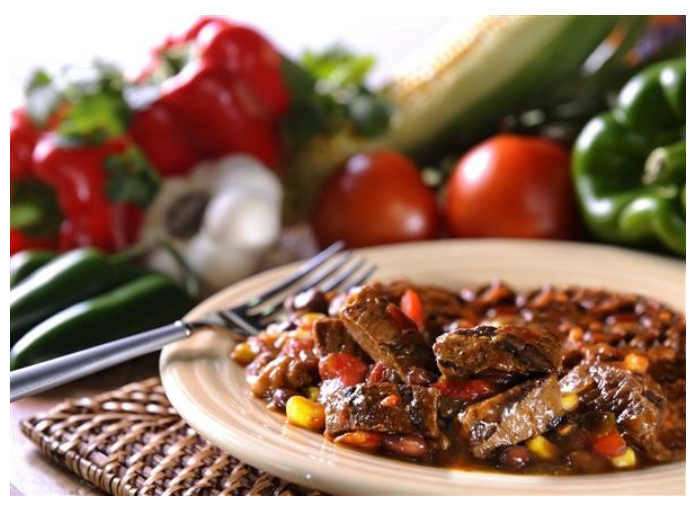
Travel card usage requirements also apply to meals, unless the use of the card is impractical.

In March 2013, the EPA's Office of General Counsel issued a "Quick Ethics Tip," titled Mandatory Use of the Government Travel Card , and advised, "... OCFO/Travel not to process any vouchers in which the traveler failed to abide by Public Law 105-264 and the implementing regulations."<sup>4</sup> The ethics tip mentioned that some employees wonder if they can use their personal cards for official travel so they can accrue personal benefits, miles or points. It also explained that employees must use the government travel card when they are on official travel, and cannot use a personal card if the employee has a government-issued travel card.