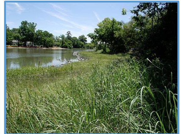
Living Shoreline in Norfolk, Virginia.