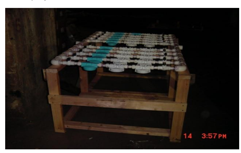
Figure 6. A filter array that is designed to hold filters of sequentially decreasing pore size.

Water management during and after the demolition operation is important for several reasons. First, water is a valuable natural resource and protecting it is vital to the environmental success of the project, and to the natural resource itself. Water can impact the demolition site in at