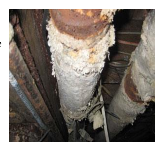
Figure 14. Pipe wrap is frequently hidden and may be difficult to find. Special wetting agents may be needed for pipe wrap.

Dedicated wetting nozzles for use when pipe wrap is encountered are recommended (see Figure 14). Note that amosite asbestos was used commercially for pipe wrap. Asbestos removal professionals take special measures whenever pipe wrap is involved because amosite asbestos repels water as well as most surfactant-treated or amended water. Special proprietary amending chemicals have been developed for use on pipe wrap that adhere to and are not repelled by the amosite asbestos. We recommend using these chemicals whenever pipe wrap is encountered.