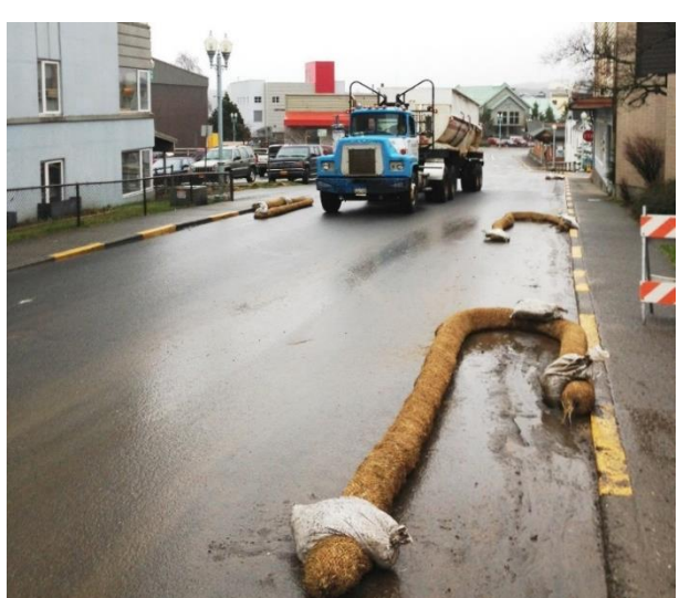
Figure 11. Sawdust-stuffed burlap tubes are weighed down with sandbags in 'U' and 'J' shapes (EPA photo courtesy John Pavitt, Region 10).

<u>Contaminated water removal</u>: We recommend the use of vacuum trucks for the removal of water that threatens to run offsite or to exceed the structural barriers in place at the demolition site. Vacuuming up water at and beyond the berms and barriers can be helpful to contain and manage the demolition water in one step. We recommend vacuuming all