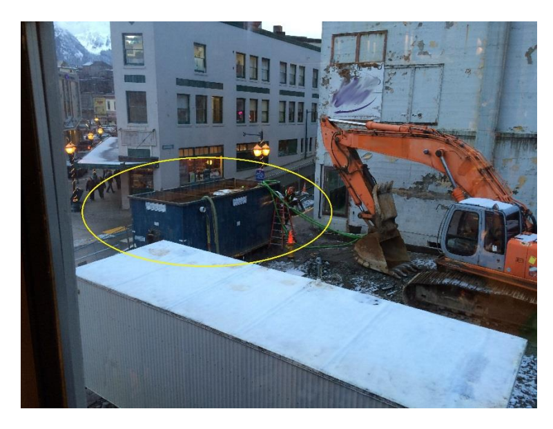
Figure 8. Water from a building demolition drained into the basement and was pumped to this tank (circled in picture) for settling before filtration to remove asbestos and other pollutants.

slight sheen on the water's surface. Sorbent pads were then used to remove the small amount of hydrocarbons.