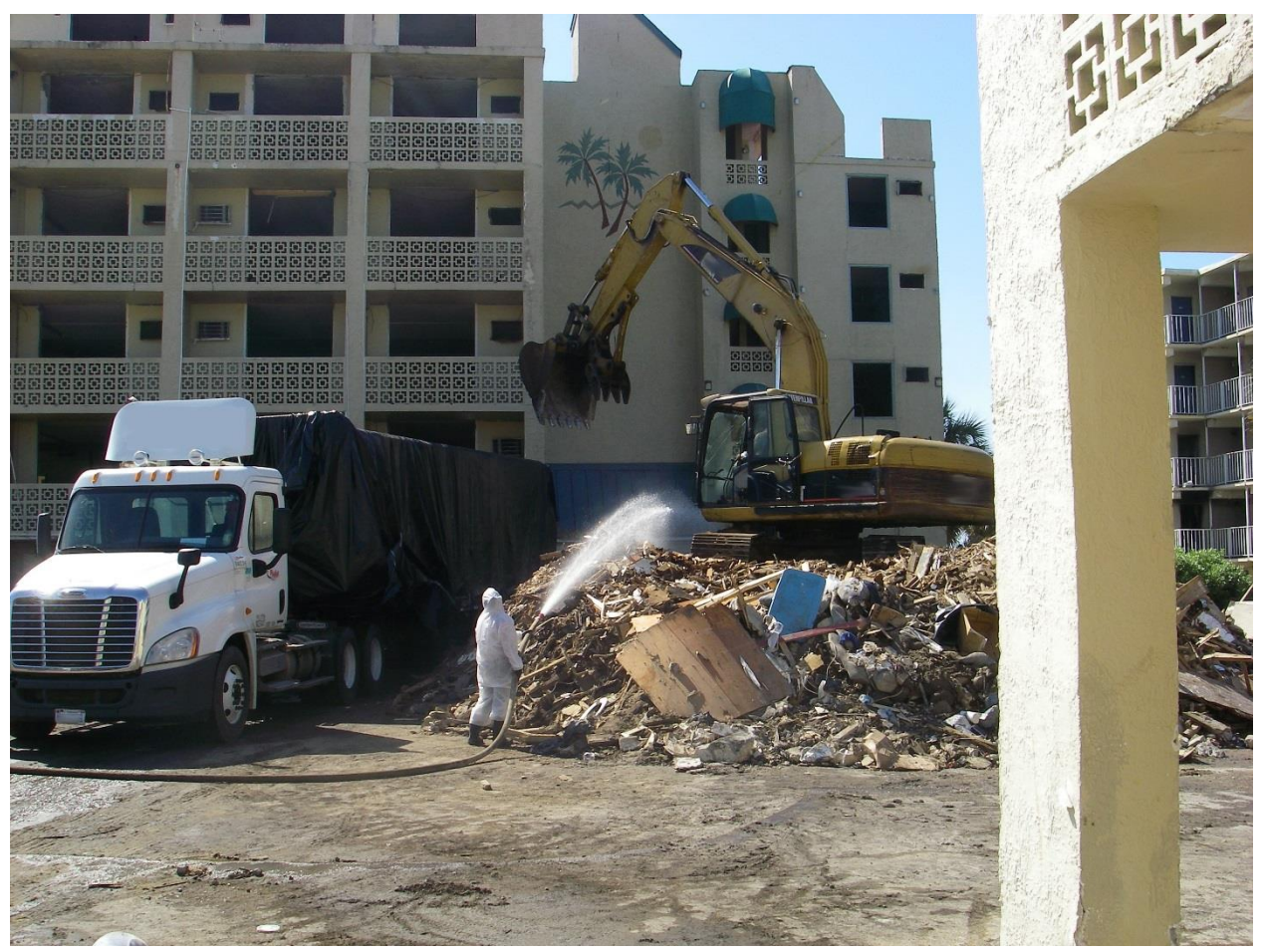
Figure 4. Ordered demolition of a structure on sandy soil in a coastal area. Water drains readily through this soil, and asbestos carried by the demolition water becomes embedded in the sandy soil.