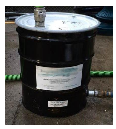
Figure 9. A carbon-filter within this 60gallon drum is used to remove hydrocarbons and asbestos from water collected in settling tank. No endorsement is implied. Information is included for instructional purposes only.

This collected water was then pumped from the basement into a large (8'x8'x20') baffled tank, as shown in the photo in Figure 8, where grit and fine particulate debris settled out and hydrocarbons floated to the surface. The presence of hydrocarbons was indicated by a