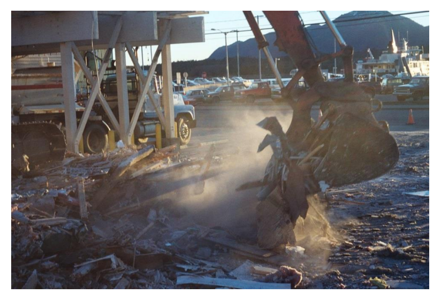
Figure 2. This photo illustrates the practical need for adequate wetting of asbestos contaminated materials. Dust containing asbestos is released when ACM are not removed prior to demolition..

We recommend State and local agencies, demolition contractors, and city planners use this document when building demolitions are being planned, scheduled and started with asbestos-containing building materials to remain in place during demolition. This can occur under NESHAP-compliant demolitions in three ways: 1) when asbestos containing materials (ACM) are