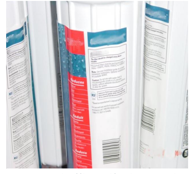
Figure 7. Examples of filters used for asbestos removal in the array in Figure 6. Photo courtesy of John Pavitt, USEPA Region 10. No endorsement implied. Information included for instructional purposes only.

To minimize total water use, we recommend filtering and reusing demolition water for the duration of the demolition work. In the example shown by Figures 6 and 7, filters, starting with a sand filter (similar to those used for pools), followed by micropore filters in series, sequentially decreasing in size from 12 to 1 micron may be used to filter out asbestos with other suspended solid pollutants as sediment entrained in the water. This may be especially useful with