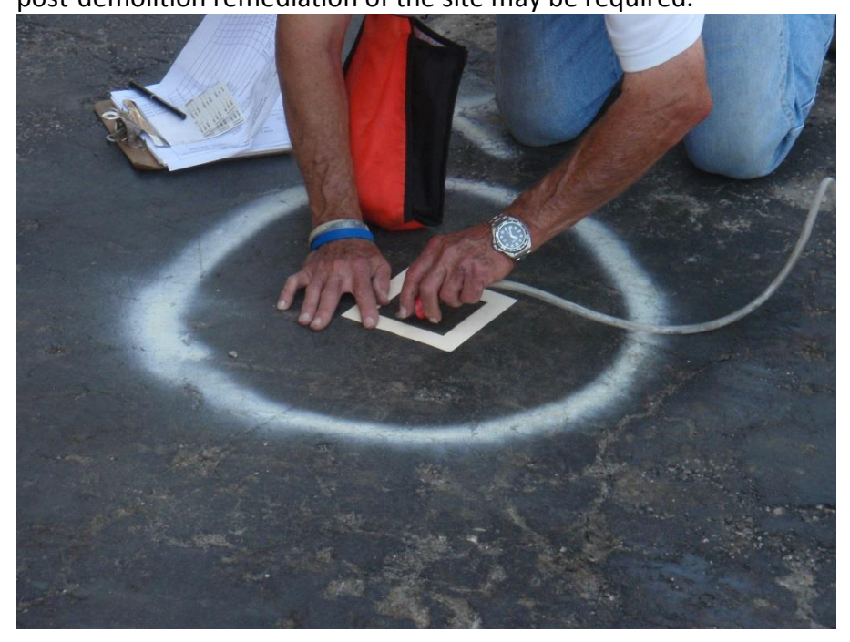
Figure 15. Micro-vac sampling is one method that may be used to indicate that non-porous surfaces, such as this asphalt parking lot, have not been contaminated by asbestos after the ordered demolition of the hotel featured in Figure 4.

If the work plan was well developed, contingency plans were followed, and the waste water from the demolition site was properly managed, controlled and contained, there may be no remediation of the site needed. However, when violations of the standard or unexpected and unforeseen circumstances arise that cause or contribute to asbestos contamination of a site, post-demolition remediation of the site may be required.