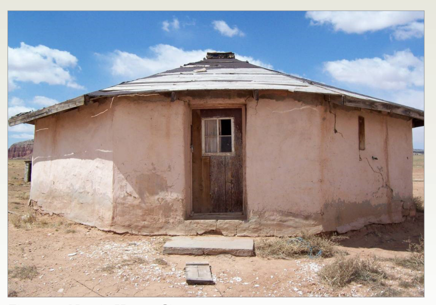
Figure 2: Navajo Hogan Circa 1960 – 1970