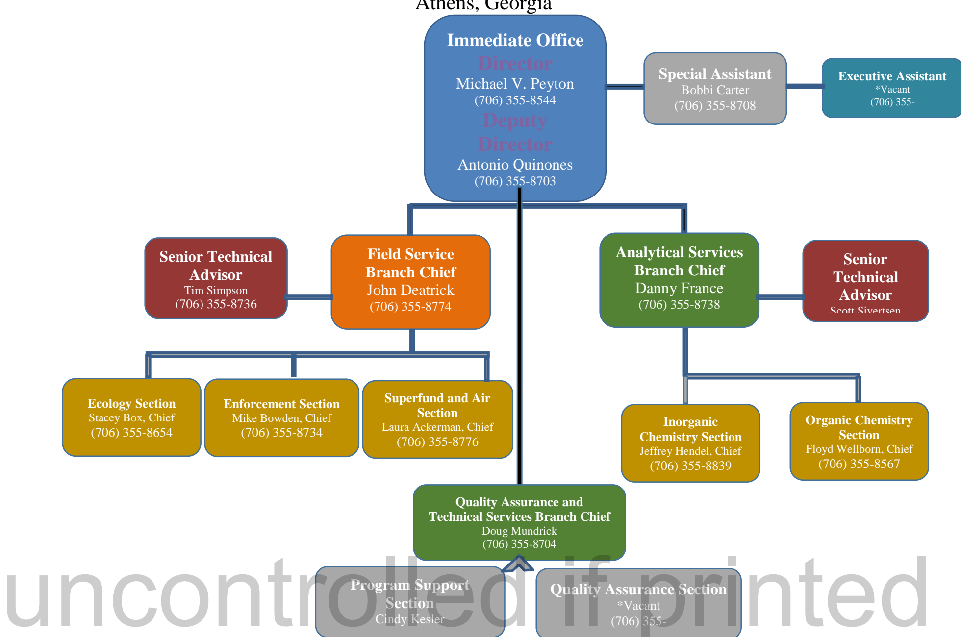
Figure 2-2: Science and Ecosystem Support Division Athens, Georgia

Date: Feb. 29<sup>th</sup>, 2016 Page: 11 of 11