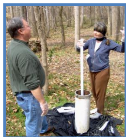
Phase II Start