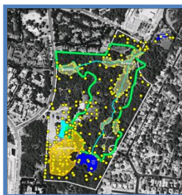
Phase II Complete