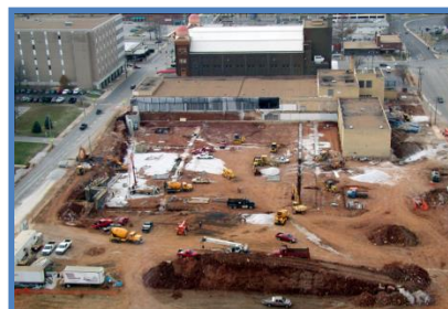
Institutional Controls In Place