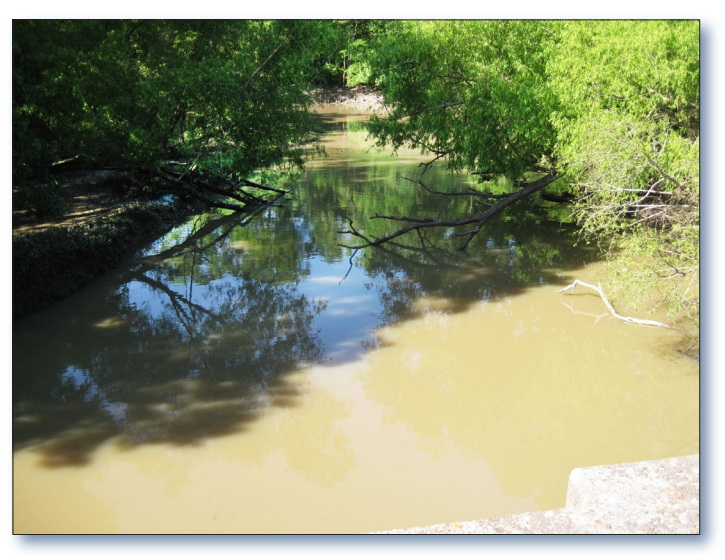
Figure 3. Bayou Mallet below Louisiana Highway 95 in 2015, after restoration efforts improved dissolved oxygen levels and restored the FWP designated use.

Dissolved oxygen concentrations improved in Bayou Mallet as a result of the BMP implementation. In the 2008–2009 monitoring period, one sample was below 3 mg/L in the summer season. In the 2012–2013 monitoring period, one sample was below 5 mg/L in the winter season. These results translate to a less