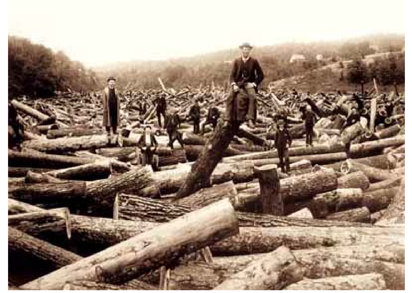
Log Jam at Taylors Falls 1884