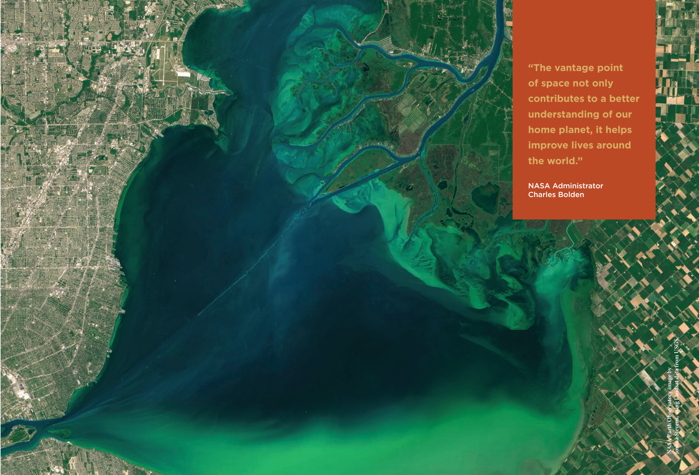
Algal bloom in Lake St. Clair.

“The vantage point of space not only contributes to a better understanding of our home planet, it helps improve lives around the world.”