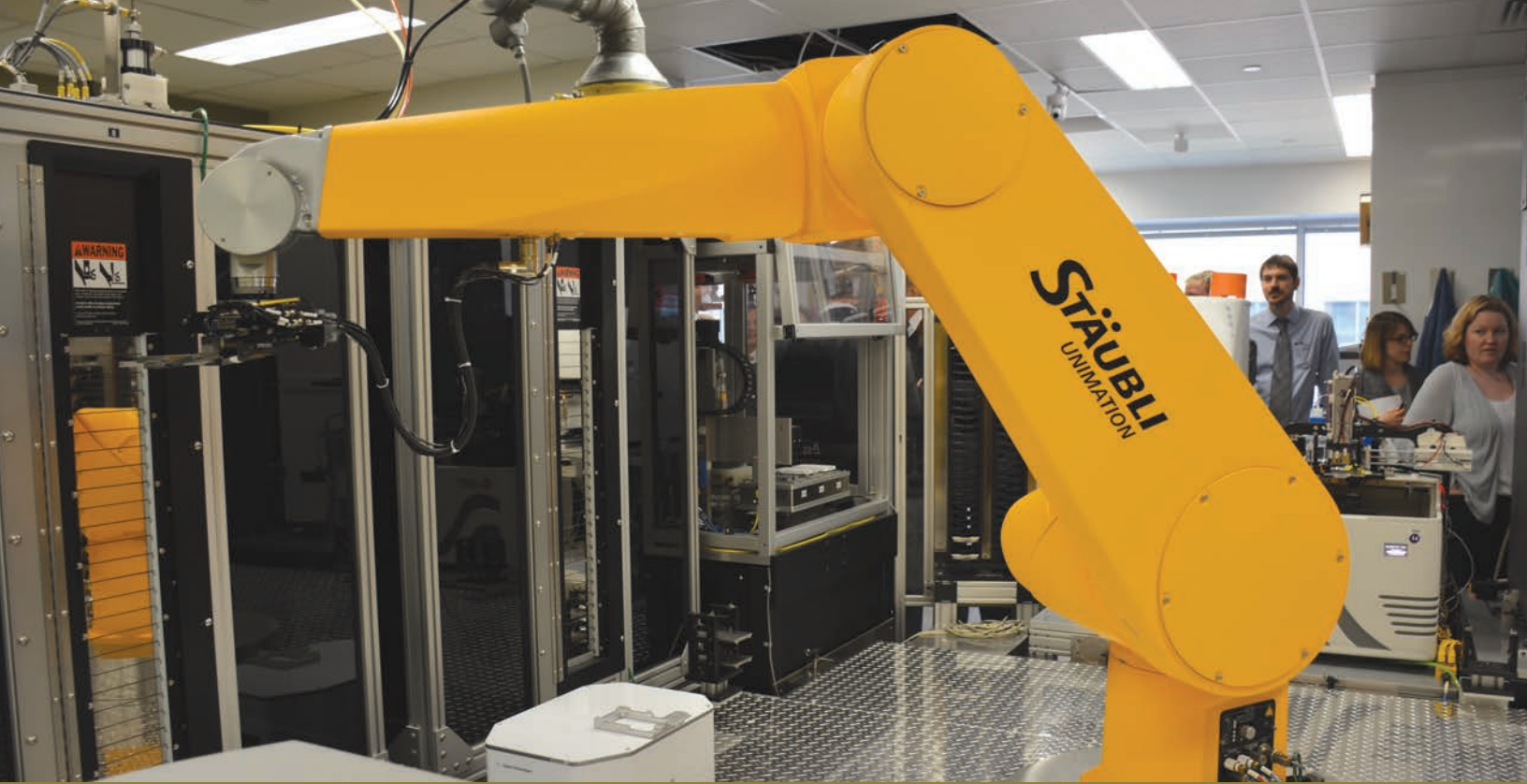
The Tox21 robot, developed in a collaboration between EPA, NIH, and FDA, helps conduct high-throughput screenings.