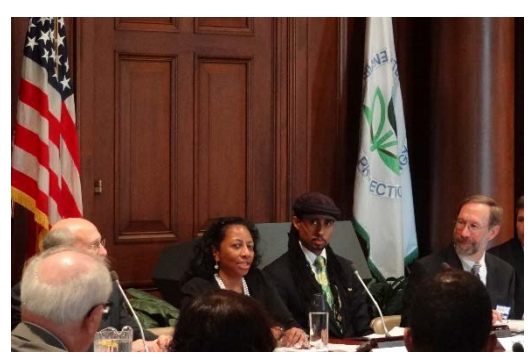
EJ IWG Senior Principals Meeting

In 2011, the EJ IWG agencies took a landmark step to support environmental justice by signing a Memorandum of Understanding<sup>3</sup> on Environmental Justice and Executive Order 12898 (MOU) and adopting a Charter. The MOU serves as a formal agreement among federal agencies to recommit to addressing environmental justice through a more collaborative, comprehensive, and efficient process. The Charter, revised in late 2014,<sup>4</sup> outlines the EJ IWG governance structure which includes the following four standing (permanent) committees: