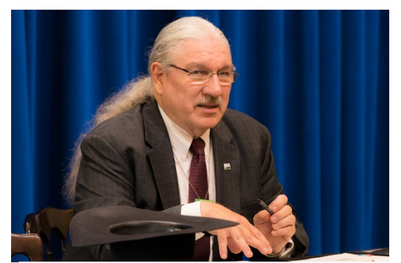
Butch Blazer, Deputy Under Secretary for Natural Resources & Environment