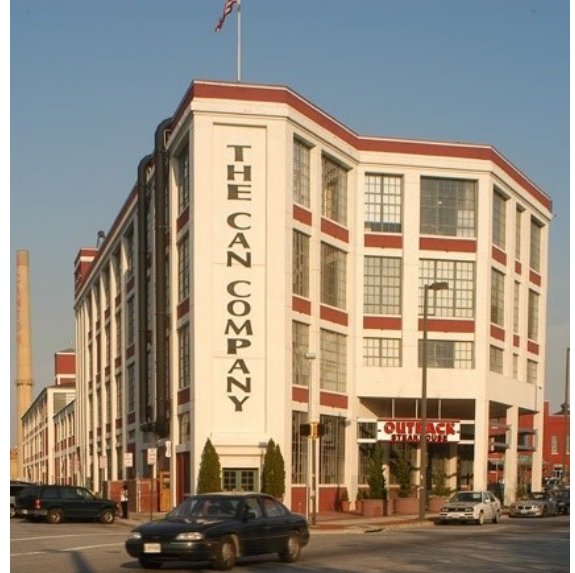
The Shops and Offices at the Can Company and community events, such as the music festival