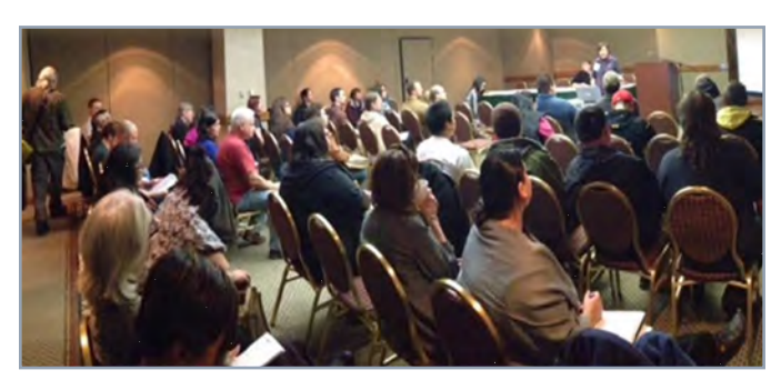
Participants attending the Brownfields Track presentation at the 20th Annual ATCEM.

ALASKA NATIVE TRIBAL HEALTH CONSORTIUM TRIBAL (ANTHC) - The ANTHC Tribal Response Program used Section 128(a) Response Program funding to successfully incorporate a Brownfields Track into the well-attended conference, Alaska Tribal Conference on Environmental Management (ATCEM). Founded in 1994, ATCEM aims to bring together tribes, non-profits, states, and federal organizations for a week of environmentally specific sessions, presentations, and trainings that lead to collaborative discussions on finding and implementing solutions that address the unique environmental concerns that face Alaskan communities. Over 470 registered participants and 180 Alaska Native/ American Indian-recognized tribes attend the 20th Annual ATCEM held in October 2014. The ANTHC Tribal Response Program (TRP) partnered with EPA Region 10, the United States Coast Guard, and the Alaska Department of Environmental Conservation to present within the ATCEM Brownfields Track. The addition of these state and federal agencies and success stories from other tribal response programs across Alaska provided well-rounded and highly attended presentations. Comments from attendees of the Brownfields Track reported outstanding overall experience with additional benefits to TRP coordinators across all levels of experience.