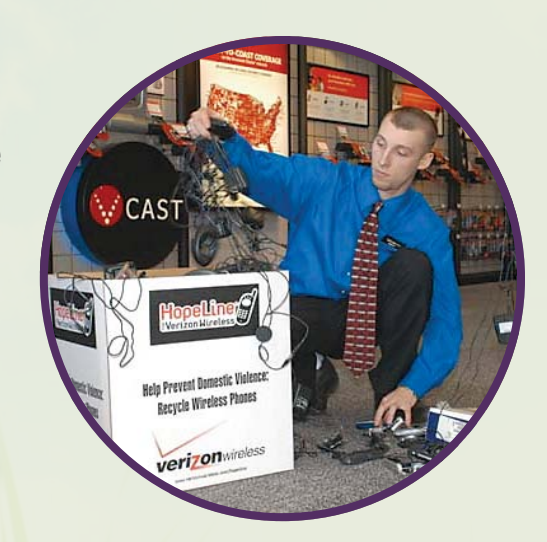
WasteWise Hall of Fame Member Verizon Wireless

Any organization can join. Our partners range from large and small businesses to nonprofit organizations to federal, state, local, and tribal governments. Regardless of your organization's size or structure, the flexibility of WasteWise allows you to design a waste reduction program tailored to meet your specific needs.