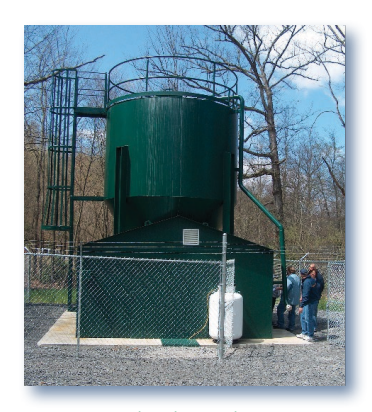
Figure 2. This lime doser was installed as part of the Three Fork Creek restoration.

Save the Tygart Watershed Association. A new cost-effective approach to treating multiple discharges was necessary to achieve the desired watershed improvement. Ultimately, it was determined that instream, active treatment using lime dosers was the most viable option for treating the creek. Construction of the dosers was initiated in July 2010. Each system was completed and actively treating water by April 2011 (Figure 2).