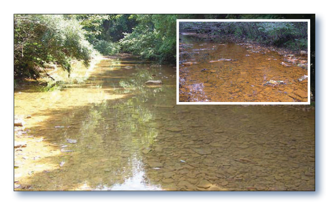
Figure 4. Raccoon Creek before (inset photo) and after (main photo) lime dosing was implemented upstream.

Restoration has led to improved biological conditions, as shown by increased populations of fish and benthic macroinvertebrates (including pollution-intolerant mayflies, stoneflies and caddisflies, collectively referred to as EPT—short for the order names Ephemeroptera, Plecoptera and Trichoptera). Pre-construction biosurveys in the watershed found a limited number of benthics (eight total taxa and three EPTs) and a single fish. Post-construction biosurveys in 2012 found positive benthic diversity (15 total taxa and eight EPTs) and a dramatic fish response. A total of 1,605 fish were collected, representing 21 species. Physical conditions have also improved (Figure 4). The local residents have noticed; many are taking advantage of the recreational opportunities now available in the watershed.