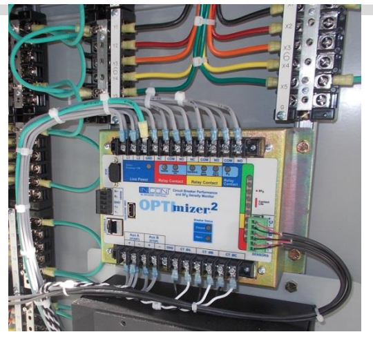
Pumped-Storage Generator Breaker