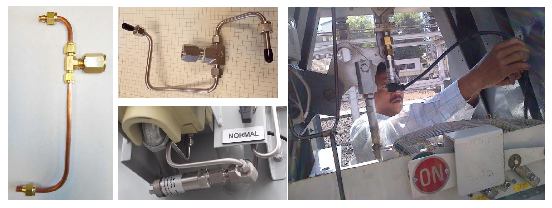
ABB PA/PM Breaker