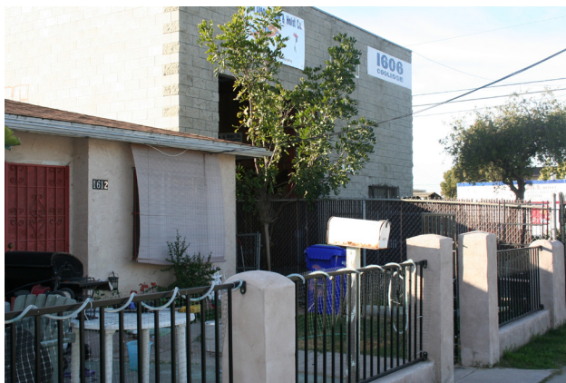
A common site: Residences mixed in with industry and small businesses including auto-body repair shops.

EHC also provides leadership training through SALTA (Salud Ambiental Lideres Tomando Acción – Environmental Health Leaders Taking Action) where skills for political advocacy and strategy, group organizing, and communications strategies are taught. Members who become very involved can become members of one of EHC’s Community Action Teams (CAT), which guide the development and implementation of community strategies.