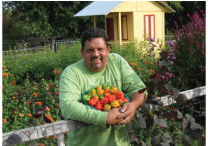
Nuestras Raíces Farmers' Market Manager sells Ajices Dulces, Puerto Rican Sweet Peppers.

Working with the city's economic development department, the Nuestras Raíces CARE project leveraged technical assistance funding for brownfield assessment of several sites. This partnership has strengthened the city's commitment to creating industrial redevelopment policies that will avoid the production of future brownfields and will instead