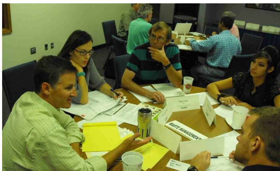
Environmental Leadership Council members discuss condensing 92 pages of environmental concerns down to 19 environmental issues.

The community discussions were part of the process that would eventually determine the community's top environmental concerns. As a result, 52 discussion groups occurred, involving more