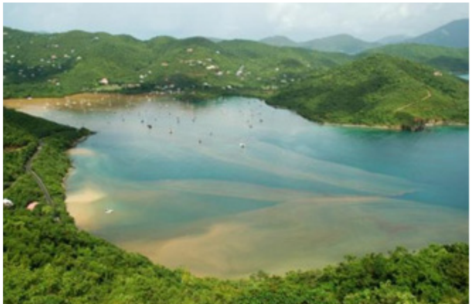
Addressing sediment plumes into Coral Bay's coral reef habitats was a priority of the Coral Bay Community Council.