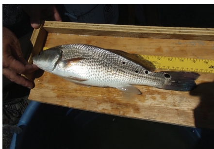
The river is already being restored with return of fish species and reduction in fish cancer rates.

Sediment cleanup has always been Elizabeth River Project's main focus since it was known that the river could not recover unless the contamination on the bottom of the river was remediated. These sediments have resulted in 70