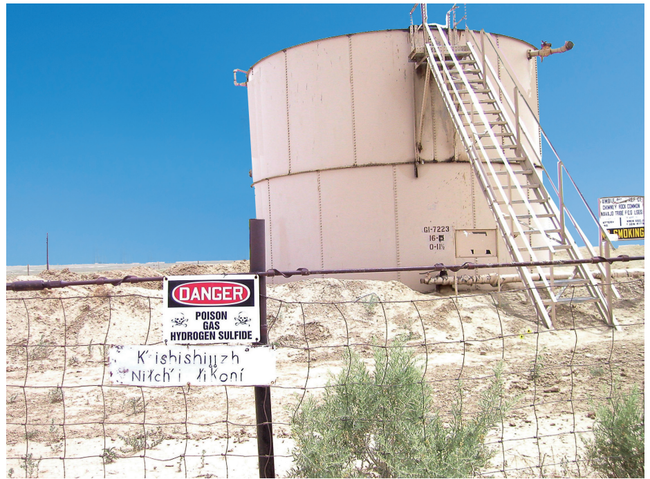
Oil and gas facilities located on northern Navajo Reservation lands.