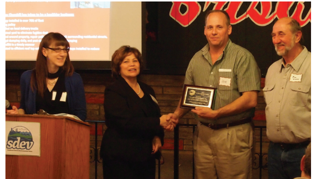
One company receiving the "Healthy Home Partner Award" for investing over $2 million in improvements to make its facility and equipment more energy efficient and for reducing waste and pollution.

The Healthy Homes Project is providing risk reduction tools to households at highest risk for lead poisoning. Homes with three or more cases of recorded lead poisonings in Southwest Detroit and South Dearborn are being provided tools to address lead poisoning, asthma and breathing problems. Over one third of the population of these communities are children. To date, 30 Healthy Homes visits have been completed with high risk families in Southwest Detroit.