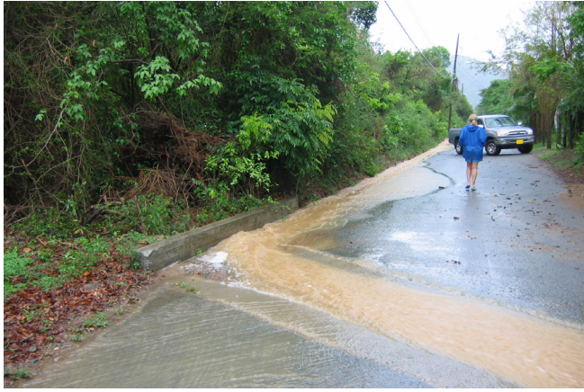
Innovative stormwater techniques were used to control runoff such as this photo shows.

and Atmospheric Administration (NOAA) and EPA for assistance. In 2007, NOAA funded a Watershed Management Plan (WMP) as a pilot watershed plan for Coral Bay. CBCC then applied for the CARE level II grant in 2008 to carry out the objectives in the WMP, resulting in the Coral Bay Watershed Management project ( http://www.coralbaycommunitycouncil.org ).