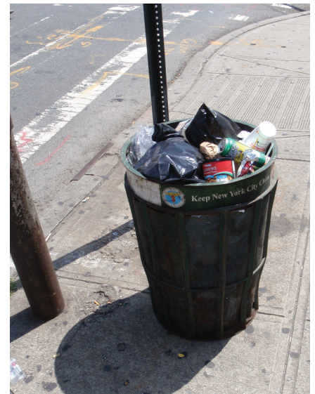
Sources of food and water create perfect havens for pests to flourish.

of seven local residents that implemented the Environmental Health Community Survey (EHCS), the Collaborative was able to gain insight on environmental health