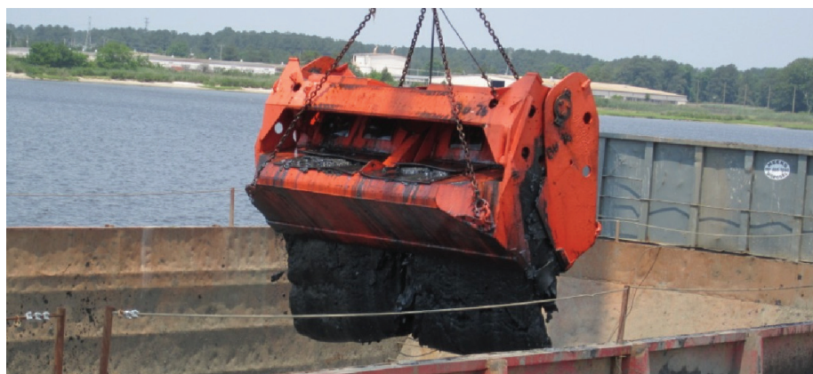
The first phase of the project included dredging 750 cubic yards of Polycyclic Aromatic Hydrocarbon (PAH) contaminated sediments and using a wetland cap to isolate river contamination. Phase II began in the summer of 2011 when the Elizabeth River Project dredged over 15,500 cubic yards of highly contaminated sediment out of the river and replaced it with clean sand.

Through the CARE process, Elizabeth River engaged industry, regulators, and citizens to develop a detailed design for dredging contaminated sediments from the river and constructing the first known living cap of its kind