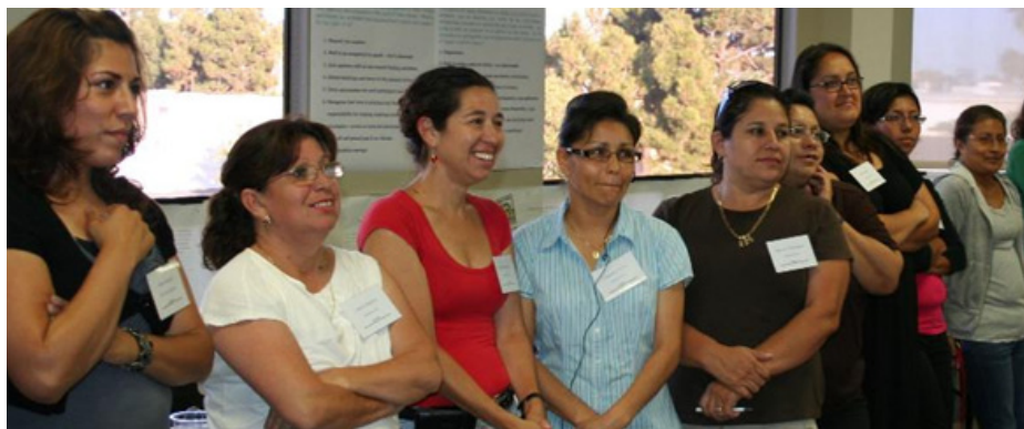
2011 graduates of SALTA Leadership Training Program.