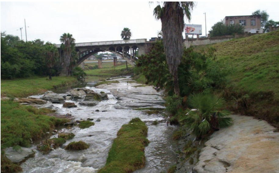
Cleaning up trash and eyesores left this community cleaner, healthier and more economically sustainable.

shared resources and methods to maximize their outreach capabilities. Community members became environmental leaders empowered to make a difference in their own health and to improve their community. The project led to residents demanding more environmental programs and education and accepting greater responsibility for the care of their community's health and environment. The project created sustainable programs that have the support of Laredo citizens and have become integrated into city government programs.