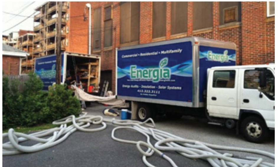
Nuestra Raices launched Energía, a green energy services company, which provides green jobs for youth.