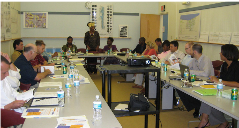
The CARE community's Business Roundtable provided a neutral forum for honest communication on voluntary measures to improve community health with industry, residents, state and local government, and others.

Finally a sustainable collaborative partnership was created that consists of a diverse cross-section of individuals representing all interests. Discussion topics address what each entity is doing on a voluntary basis and how they are taking into account the community's needs. The roundtable serves as a powerful forum for raising issues with some issues "spinning off" to be addressed by other venues. As a result of a chemical spill, the group immediately called for