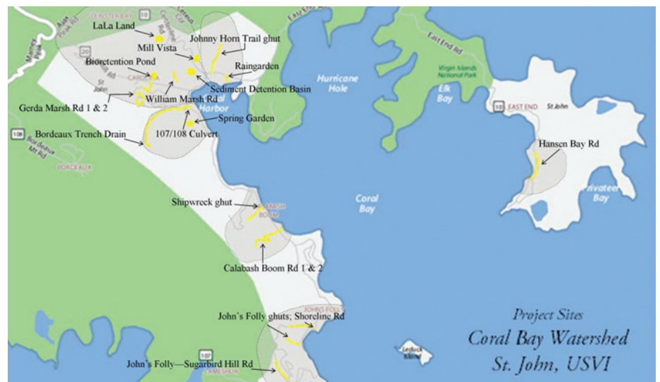
Coral Bay Watershed, St. John, United States Virgin Islands.

The CARE grant also enabled the community to take actions to improve the island's drinking water supply. In Coral Bay, rainwater is collected from roofs and stored in cisterns for use as potable water in homes and businesses. Using EPA Drinking Water standard testing, a study was done of cistern water to determine if readily available means of purifying the water could help control contaminants coming from the air and birds and other wildlife on roofs and in gutters. The study concluded that a $1,000 UV lamp purification and filtration system was an easy and cost-effective solution to purify the water. Since most people do not have these systems installed and