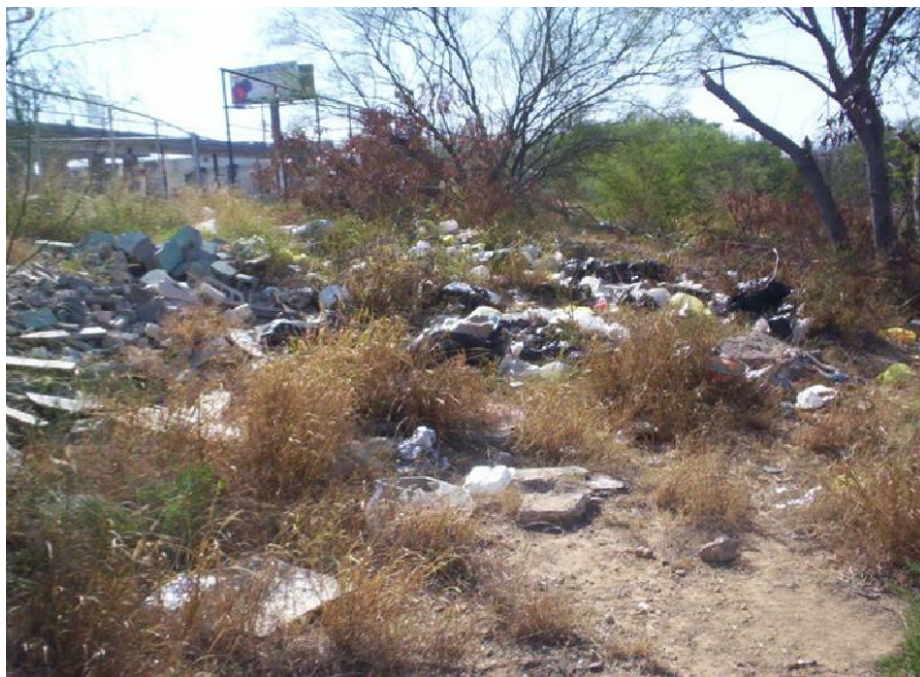
Over 900 citations for illegal dumping helped the city clean up.