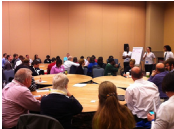
The signature of the project was engaging the community in land-use planning. Over 900 residents and other partners were involved.

travel with ease to Boston, they are understandably concerned with future land-use developments.