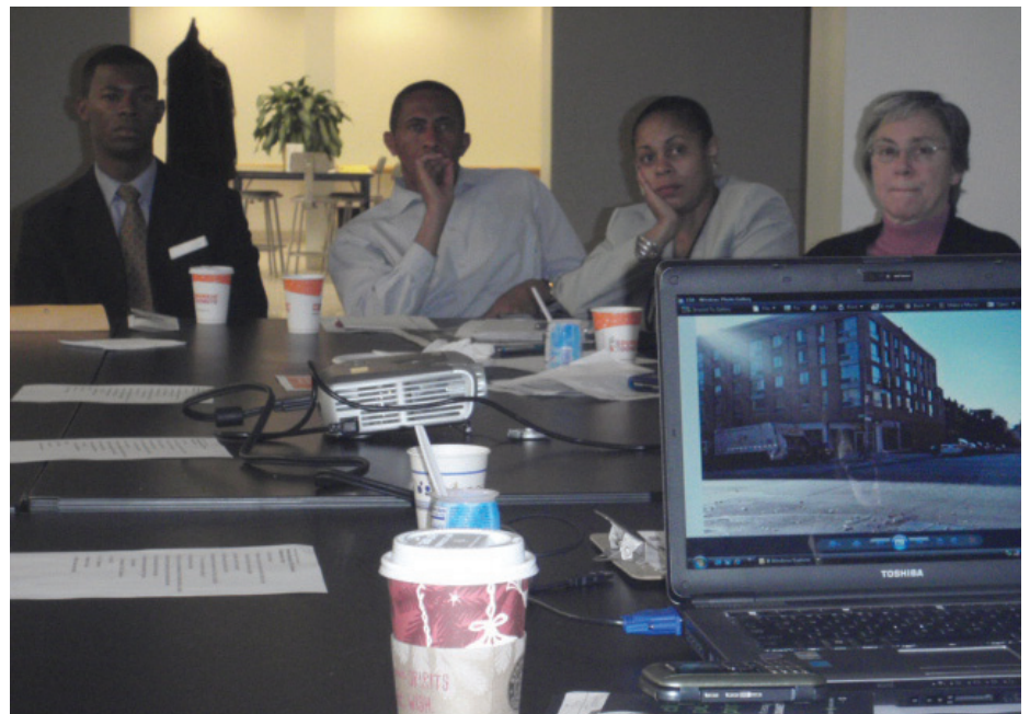
A PhotoVoice Project was used. Photos were taken of unsuccessful and successful garbage management and discussions of the problems and solutions were organized around the photos.

In this segment of the CARE project, the Collaborative built a fruitful partnership with local businesses and the Department of Sanitation to reduce garbage and pests. Businesses were engaged on garbage and pest issues through the Northern Manhattan Business Roundtable. Another PhotoVoice project was launched, this time providing business owners disposable cameras to document problems. Cameras were collected and a meeting held to discuss perceptions of the solid waste issues in the community and to collaboratively arrive at potential solutions. One complaint that was raised from, some businesses in Central Harlem was that they felt that they were being targeted for fines by the NYC Department of Sanitation.