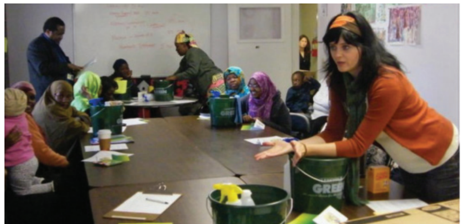
A Program Manager explains the dangers of cleaners that are purchased during one of the Healthy People, Healthy Places workshops.

Other partnerships were developed with the local business community in creating "The Guide to Green Products in North/Northeast Portland," ( http://www.jhillclinic.org/wp-content/uploads/2009/06/nne-pdx-green-guide1.pdf ) The project's Green Business Marketing Specialist asked business managers and owners for permission to collect data on green products and services that are available at their stores, such as information about green product types, prices, and sizes, product placement, promotions, and a narrative of the availability and placement