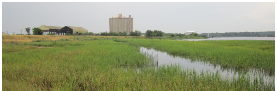
The CARE grant provided support to the Elizabeth River Project’s “River Star” program which assists industries to achieve voluntary pollution prevention (P2) in air, water and soil, as well as wildlife habitat enhancement in the watershed.

During the two-year grant period, River Stars on the Southern Branch of the Elizabeth River documented the reduction of over 15,970,000 pounds of pollution and conservation or restoration of almost 79 acres of wildlife habitat enhancement. Elizabeth River is the first sediment remediation project carried out in Virginia and one of the only community-led sediment cleanup sites in the nation.