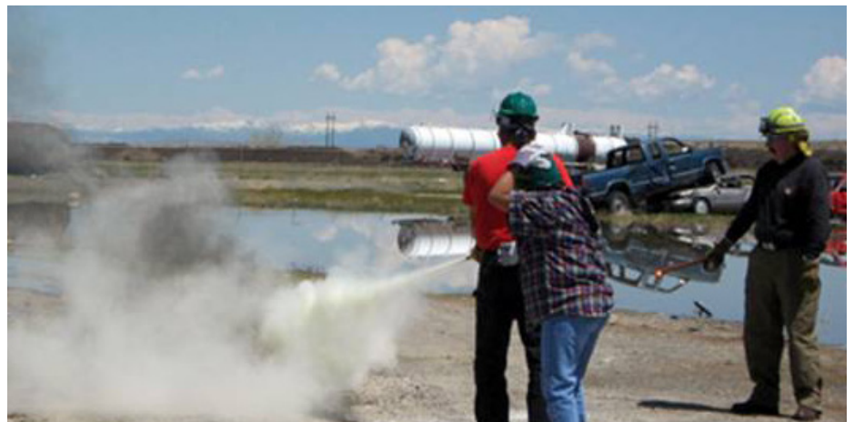
CARE community members learn how to extinguish small fires during the Community Emergency Response Team training offered in partnership with the Wind River Health Systems and Wind River All Hazards Steering Committee.

system in the CARE community. The former site of the uranium processing plant now houses a sulfuric acid manufacturing plant, that at one time operated behind locked gates. Air and water could potentially be impacted from