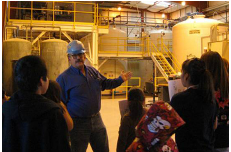
ChemTrade Logistics is a local producer of sulfuric acid and is located on the previous uranium mill processing site in the CARE community. ChemTrade opened their doors to the community and as part of the “hot spot” tours, WRA brought youth and elders to the ChemTrade facility.

Although flexibility is built into the CARE process, this process is fundamentally a linear process that starts at one point and ends at another, which is not how decisions were made in the Wind River community. The community decision-making process that emerged in this community was