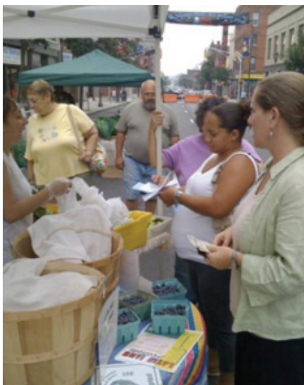
Nuestra Raices helped start local food businesses, creating jobs. Its network of farmers markets also provided increased access to produce by low-income groups by accepting SNAP/EBT cards.

CARE grantee Nuestras Raíces has built a community health coalition of diverse partners to address the multiple environmental health risks facing Holyoke's environmental justice communities and the city at large. The CARE project focused on risk factors to the community related to indoor and outdoor air quality, water quality and mercury contamination from eating fish from the Connecticut River, and