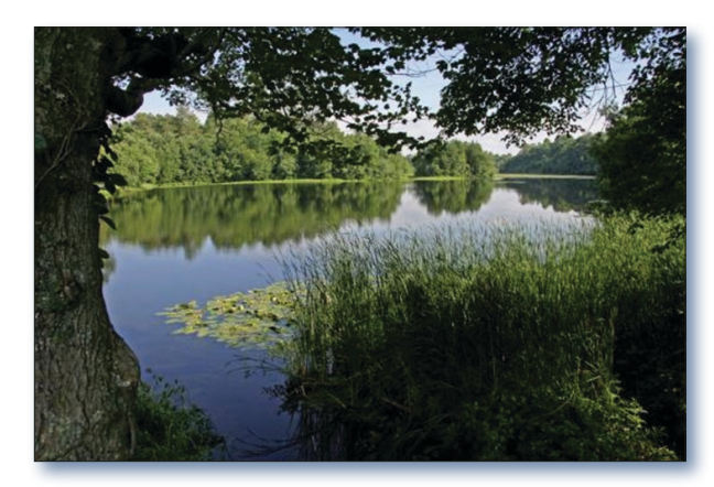
Figure 2. Abbott's Mill Pond water quality has improved, thanks to restoration efforts.

Delaware's USDA Conservation Reserve Enhancement Program (CREP) was established in 1999 to protect and enhance environmentally sensitive land and waters in the coastal plain geographic areas of the Delaware, Chesapeake and Inland Bays watersheds by establishing voluntary land retirement agreements with agricultural producers. To assist in CREP program development and implementation, in 1999 Delaware's Nonpoint Source Program committed CWA section 319 funds to create a full-time Delaware CREP Program Coordinator position. Between 1999 and 2014, the CREP Program Coordinator helped install 4.9 acres of wildlife plantings, 15 acres of grass buffers, 3.5 acres of wetland restoration, and 187 acres of hardwood trees in the Abbott's Mill Pond watershed.