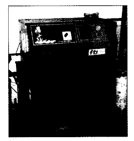
On-site, batch antifreeze recycling units are available with filtration or distillation recycling technology.