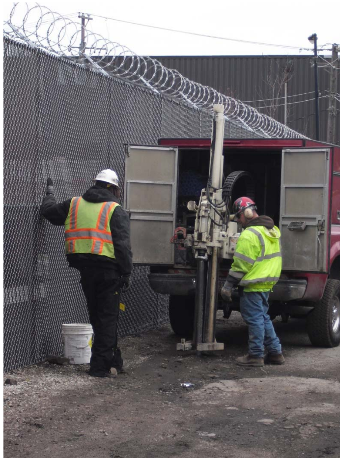
Pilsen Area Soils Site Chicago, IL. Lab Results Soil Sampling