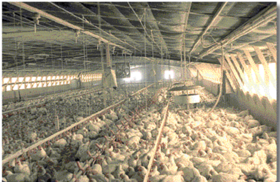
Poultry farms produced 116 billion pounds of manure in a single year.

It's not just animals, though. Chemicals in pesticides, herbicides, fungicides, and fertilizers are a third cause of water pollution. Pesticides, herbicides, and fungicides are used to kill pests such as crop-eating insects and to control the growth of weeds and fungi. Fertilizers are used to feed crops and make them grow faster and healthier. Unfortunately, chemicals used to kill bugs and weeds can also damage other things. These chemicals can enter and contaminate water in several ways—through use and overuse in or around the water, from runoff, or by the wind. And their effects can be deadly. The chemicals can kill fish and other wildlife, poison food sources, and destroy the habitat that small animals use to hide from predators.