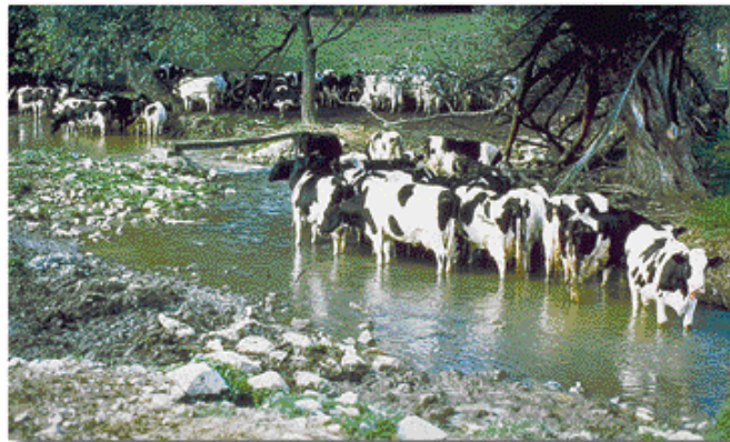
Fencing off natural streams from cattle will reduce sedimentation and nutrient pollution.

In some cases farmers use animal waste as fertilizer, and even though it's natural, if used incorrectly it can do terrible damage to water resources. In fact, it can cause eutrophication, or algae buildup, which depletes the oxygen aquatic organisms need to breathe.