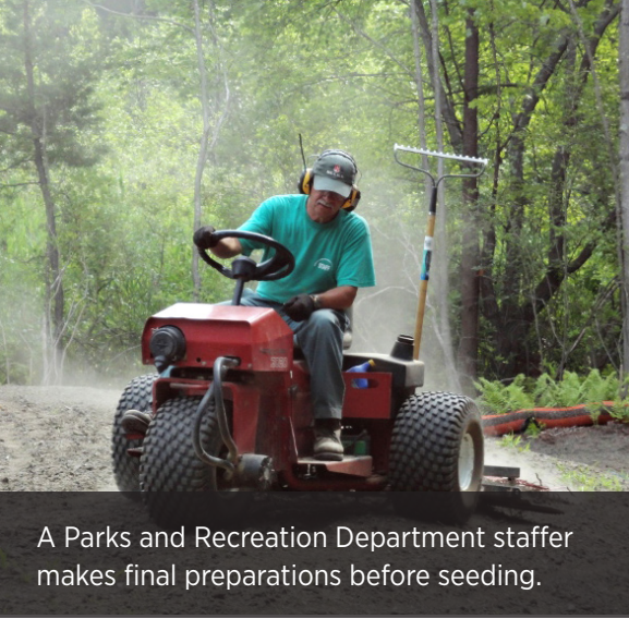
A Parks and Recreation Department staffer makes final preparations before seeding.

“ Located between two busy highways, the park is a showcase welcoming visitors to the area. ”