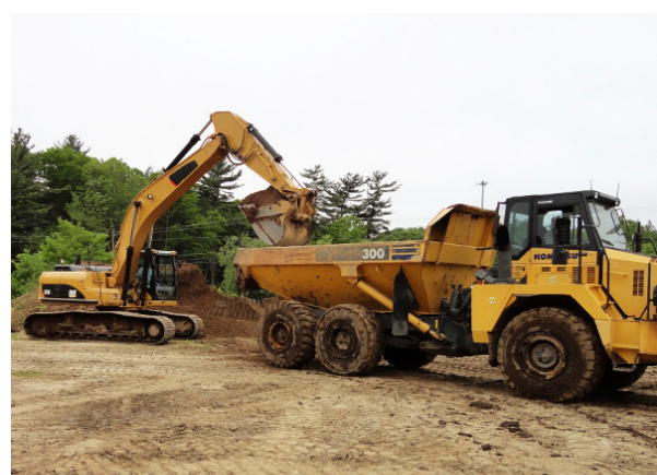
Crews redistribute screened soil to prepare the site for landscaping.

Current Use: Sandy Acres Recreation Area