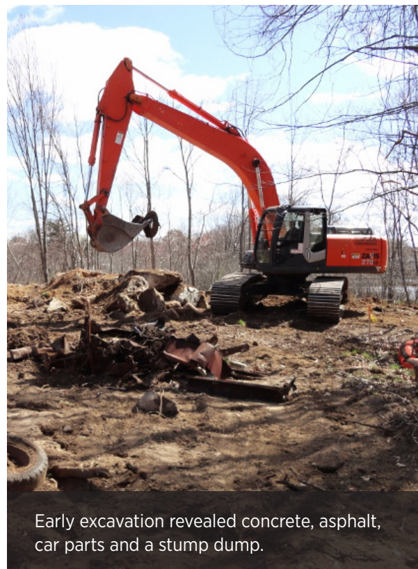
Early excavation revealed concrete, asphalt, car parts and a stump dump.