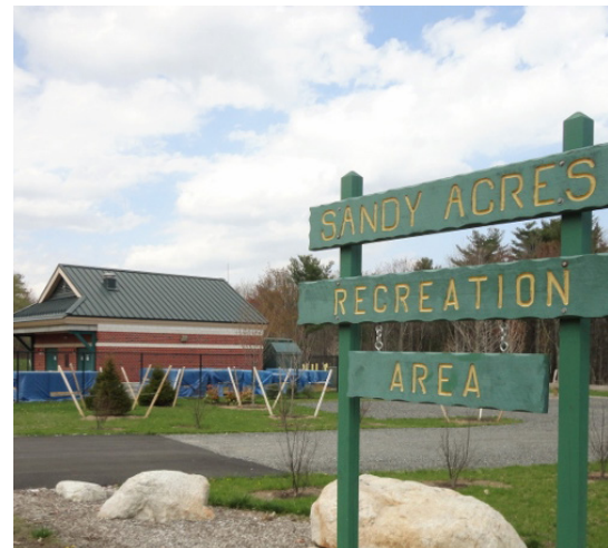
Years of hard work and collaboration brought the Sandy Acres Recreation Area to life.