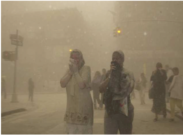
Street level conditions in Lower Manhattan after collapse.