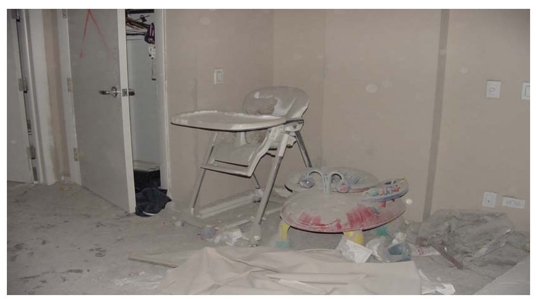
Indoor dust contamination from WTC debris.

the NYCDOH and ATSDR initiated an indoor air study in November 2001. The sampling phase was completed in December 2001, preliminary results released to the public in February 2002, and the final report issued by ATSDR in September 2002. The results of this study are discussed later in this chapter.