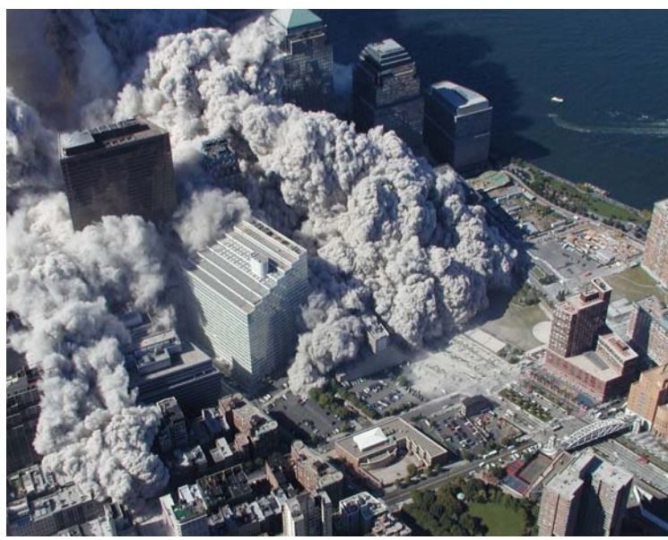
Dust cloud from the WTC collapse.

Airborne dust from the collapse of the towers blanketed Lower Manhattan and was blown or dispersed into many of the surrounding office buildings, schools, and residences. One person described the aftermath in Lower Manhattan as "looking like a blizzard" had hit. However, this blizzard did not deposit snow, but instead a complex mixture of building debris and combustion by-products. This mixture included, among other substances, asbestos, lead, glass fibers, and concrete dust.