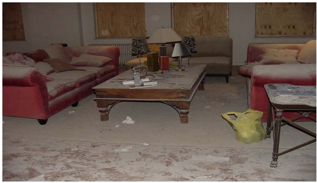
Indoor dust contamination from WTC debris.