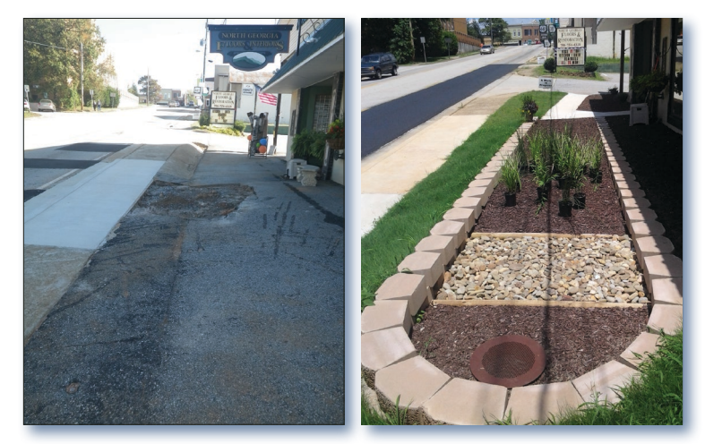
Figure 2. An impervious parking area before construction (left) and the new bioretention area after construction (right) in Clarkesville.

to identify and prioritize infrastructure needs and opportunities for additional stormwater practices. Additionally, a rain garden was installed on public property in the city of Cornelia.