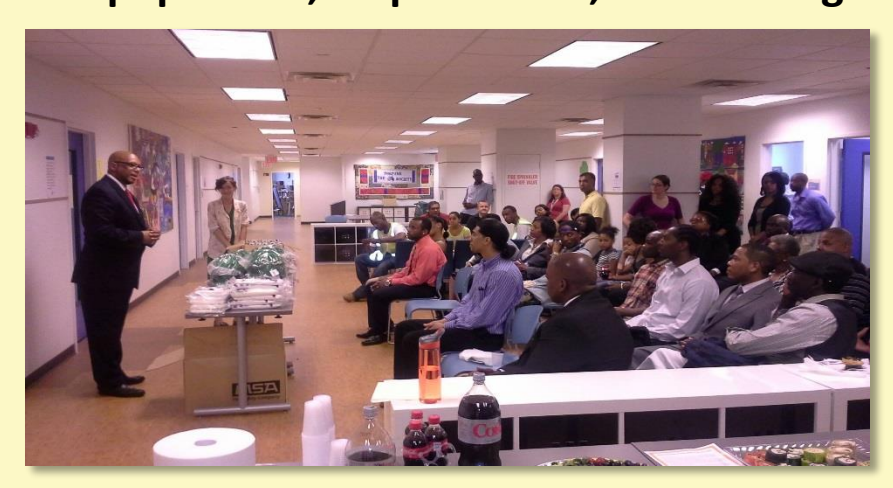
Region 2, NYC Fortune Society Guest Lecturer