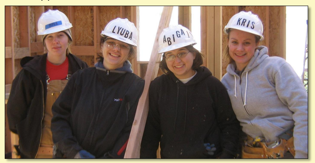
Region 10, The Oregon Tradeswomen, Inc Environmental Workforce Development and Job Training Program