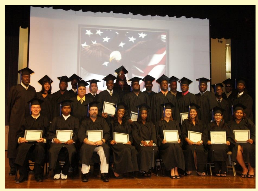
Students Graduating from Florida State College-Jacksonville's EWDJT program