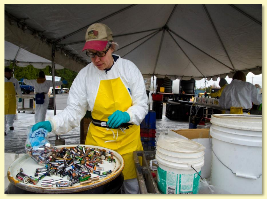
Region 10, KC Davenport Clean Up