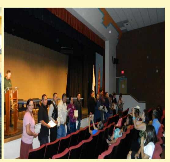
Region 9, Navajo Nation EWDJT