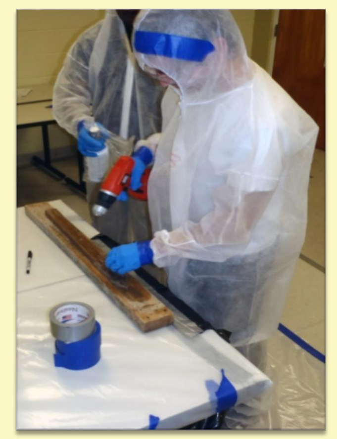
Region 4 – Durham, NC EWDJT Lead Abatement Exercise