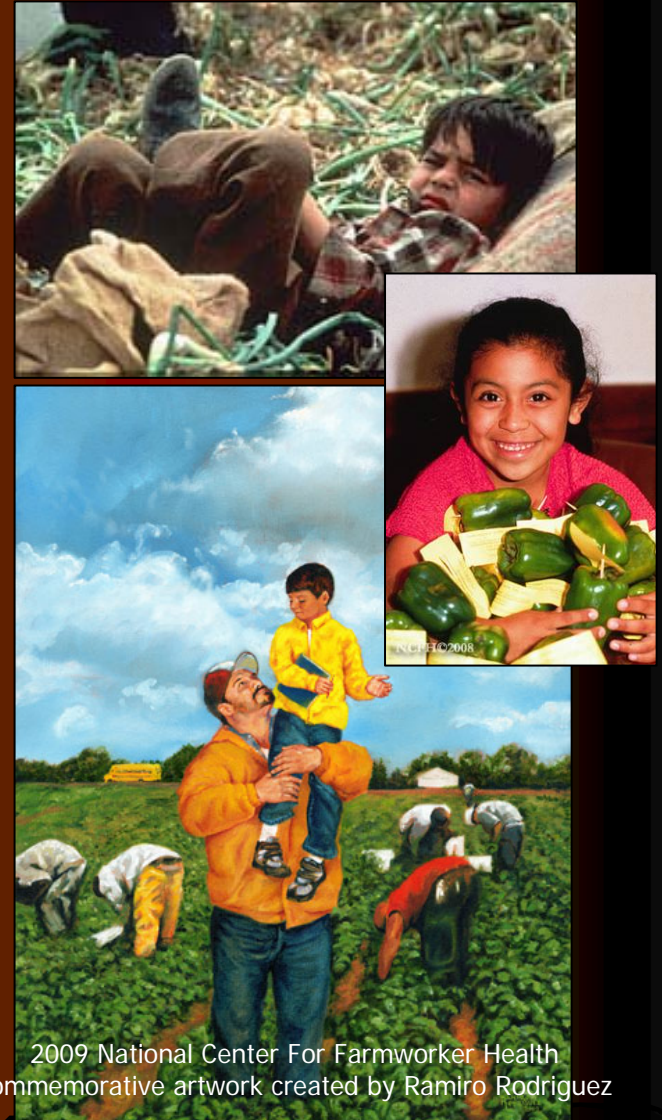
2009 National Center For Farmworker Health commemorative artwork created by Ramiro Rodriguez

take-home and in-home exposures put children at risk for acute and chronic illness