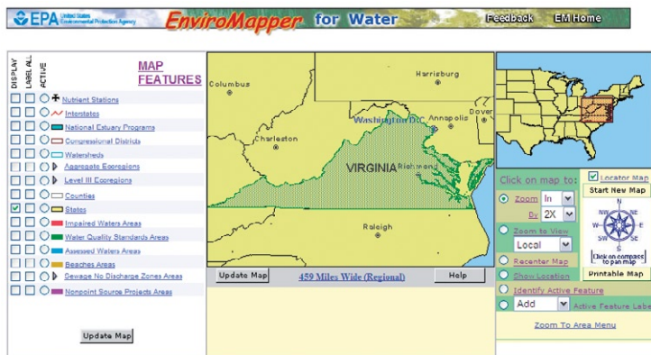
EPA's EnviroMapper for Water

are impaired, have been assigned a TMDL or drain to the Chesapeake Bay and therefore are covered by a state Tributary Strategy. This determination can be made by reviewing your state 303(d) list, state TMDL list, Chesapeake Bay Program web site or contacting your state stormwater coordinator or TMDL coordinator. Links to state 303(d), TMDL lists, and Chesapeake Bay Program web site are included in the Resources section of this document.