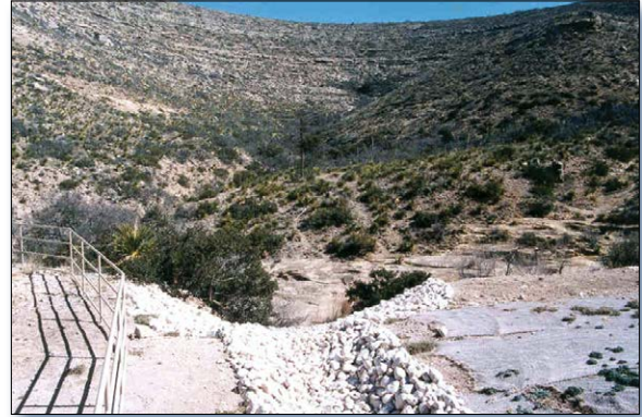
Figure 3. Restoration project efforts included adding fencing and armoring drainage ditches.

road and parking lot (Figure 3). They installed pipe fencing around the picnic areas to discourage access to the unauthorized trails and to protect the riparian area from erosion. In addition, the partners installed a new water supply well and upgraded the restroom facilities; these improvements have resolved the sanitation issue and reduced bacterial loading. Volunteer site hosts are stationed in RVs onsite to monitor the day-use area to ensure success. This project was a good example of interagency cooperation on resource management, as both agencies came together on their planning efforts to upgrade the recreation area and improve water quality.