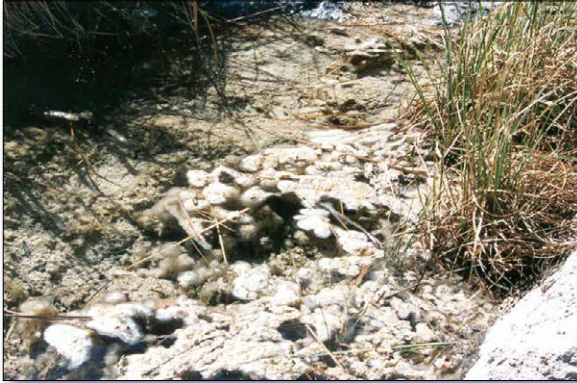
Figure 2. Nuisance algal blooms were common in pools below Sitting Bull Falls in the mid-1990s.