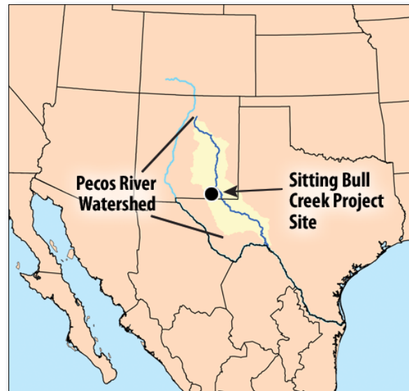
Figure 1. Sitting Bull Creek is in the Pecos River watershed in New Mexico.

Staff from the NMED Surface Water Quality Bureau (SWQB) identified the probable sources of Sitting Bull Creek's water quality problems as dispersed recreation, improper sanitation, grazing and roads. The key pollution sources were addressed before a TMDL could be developed.