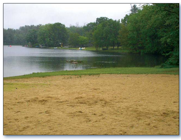
Figure 1. Crystal Lake beach in July 2008.

In 1985 NHDES completed a Diagnostic and Feasibility Study which documented that the main impact to water quality at Crystal Lake resulted from untreated stormwater runoff. The study found that sediments, nutrients, bacteria, and heavy metals were present in elevated levels. The study also noted that deposited sediment was a main component of a phosphorus rich, unconsolidated muck layer that was up to 25 feet deep in spots. In 2006, NHDES added Crystal Lake and Crystal Lake Beach to New Hampshire's section 303(d) impaired waters