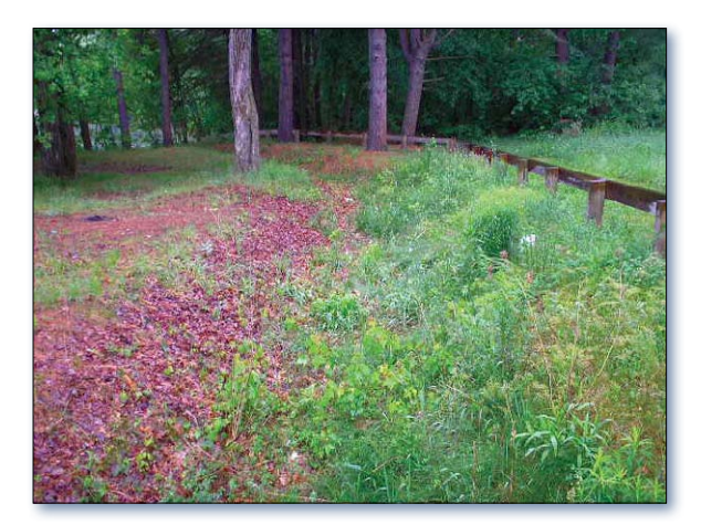
Figure 2. A vegetated swale built to treat road and parking lot runoff before it enters Crystal Lake.

the city to construct BMPs at the second outfall including deep sump catch basins, a stormwater baffle tank, lateral drains, and vegetated swales (Figure 2). As part of the non-federal match for the grant, the city dredged the beach to remove historic sediment and weed accumulations.