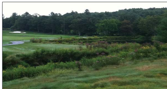
Figure 3. The Cullasaja Club improved the health of the riparian buffer along the Cullasaja River.

After years of ratings of poor or fair , August 2010 sampling data demonstrated that the water quality in the larger Cullasaja River segment had improved to good-fair (Table 1). Based on these sampling results, NCDENR determined that segment 2-21-(0.5)a of the Cullasaja River now supports its aquatic life designated use and removed it from the impaired waters list in 2012, representing an improvement in 3.7 miles of the 5.7 miles of stream originally listed in 2002. The momentum of water quality improvement continues throughout the watershed. NCDENR hopes that past and future implementation efforts will translate into improvements in the second Cullasaja River segment and the Mill Creek segment in the near future.