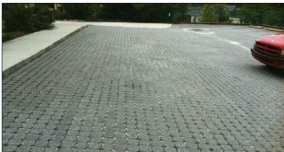
Figure 2. The town of Highlands installed permeable pavement at the Highlands Community Child Development Center.

Cullasaja River and Mill Creek. The town installed a 240,000-gallon underground stormwater management treatment and detention system in Town Park, which treats 14.6 acres of commercial area. The town also replaced three culverts in the Mill Creek drainage area and installed a 2,000-square-foot rain garden and 6,400 square feet of permeable pavement at the Highlands Community Child Development Center (Figure 2). In addition, the Cullasaja Club (a golf and family club community) funded and implemented numerous BMPs along the upper Cullasaja River, including maintaining 10 acres of no-mow, no-fertilizer areas along steep slopes; improving 3,500 feet of riparian buffer; and installing new irrigation systems in 2011 (Figure 3). In 2012 the Land Trust for The Little Tennessee River used CWA section 319 funds to develop an Upper Cullasaja Watershed Restoration Plan to help guide future implementation efforts.