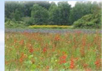
Planned Open Space