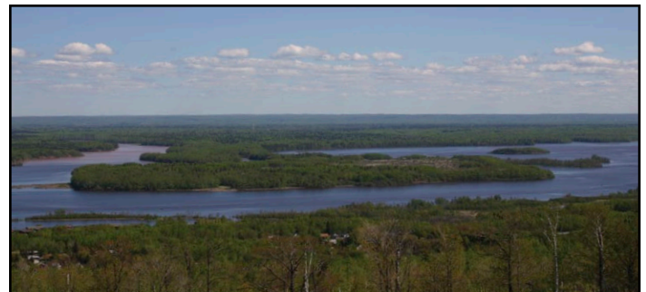
Owned by The Nature Conservancy, Clough Island is the largest island in the St. Louis River estuary.

In October 2010, the U.S. National Oceanographic and Atmospheric Administration (NOAA) designated the St. Louis River Estuary as the 28th National Estuarine Research Reserve (NERR). The St. Louis River NERR is the second freshwater estuary in the NERR system (the first freshwater NERR was Old Woman Creek, Ohio on Lake Erie). The mission of the NERR program is to promote long-term research, education and stewardship through a system of reserves that represent the various biogeographic regions of the United States. The St. Louis River NERR will also help to advance research, education and stewardship goals of the Lake Superior LaMP.