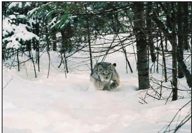
Lake Superior’s cold climate is home to many unique species, such as the Canada lynx.

The Lake Superior LaMP and Binational Program participants continue to work together to protect Lake Superior’s unique coldwater ecosystem, and to address the stressors on the lake. This Annual Report summarizes some of the recent accomplishments, challenges and next steps. For more information, please visit www.binational.net or use the contacts listed on the back page. ♦